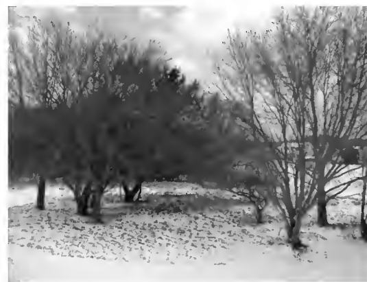
Winter at Newcroft