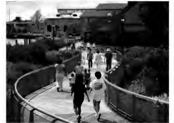
Native plants on both sides of the Riverwalk

Park your car and stretch your legs along the Riverwalk. This 1.3-mile riverfront path provides pedestrian access to attractions from Tubman-Garrett Riverfront Park to a nature center. Strollers can enjoy extensive native plantings with more than 5,000 trees and shrubs, 36,000 grasses, perennials and annuals, and 27,600 wetland plants. At the eastern end of Wilmington's Riverwalk lies