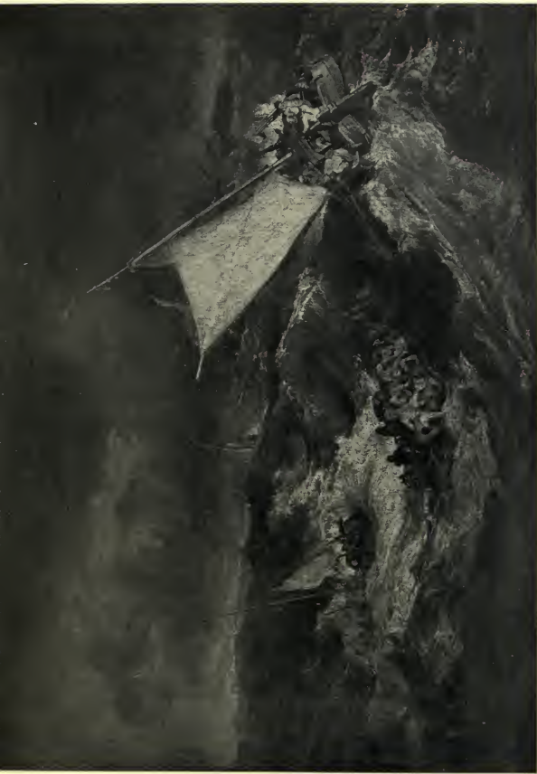
MASTERS IN ART PLATE VI

TURNER THE SHIPWRECK NATIONAL GALLERY, LONDON