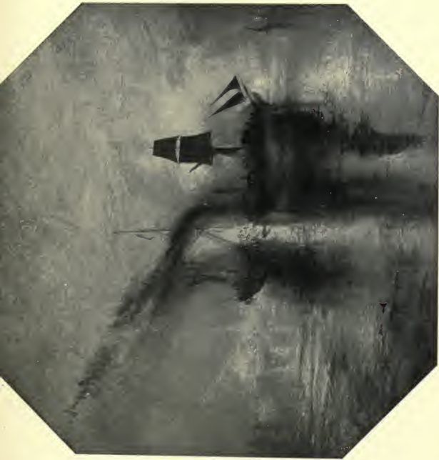
MASTERS IN ART PLATE IX

TURNER PEACE: BURIAL AT SEA NATIONAL GALLERY, LONDON