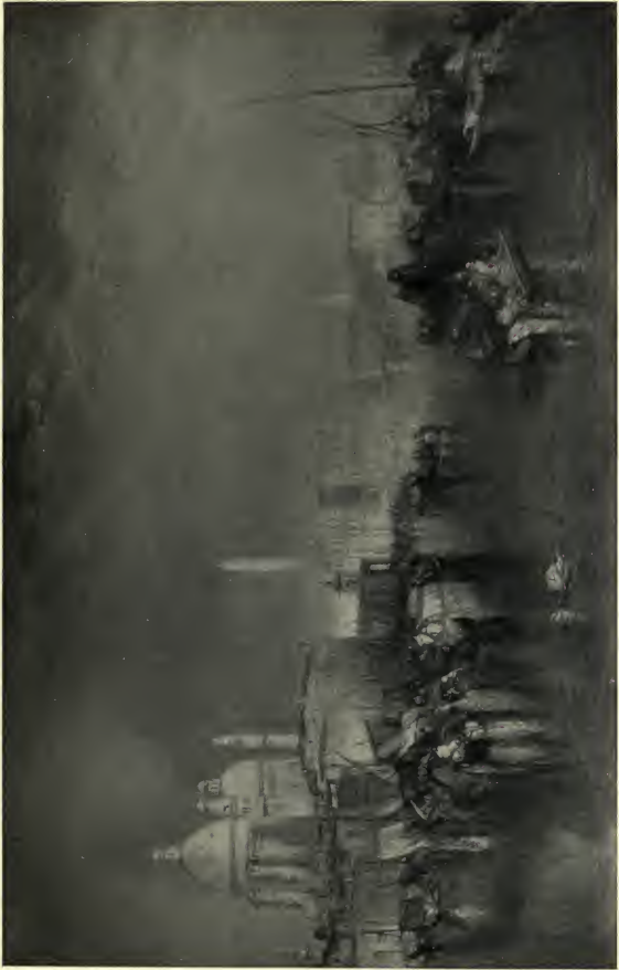
MASTERS IN ART PLATE VIII