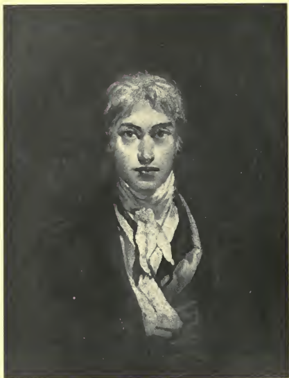
PORTRAIT OF TURNER BY HIMSELF NATIONAL GALLERY, LONDON

In later years Turner's appearance was far from engaging. Short, stout, and bandy-legged, his hat always brushed the wrong way, his sleeves long enough to hide "the smallest and dirtiest hands on record," his nose hooked and prominent, his blue-gray eyes staring, his face "as red as a boiled lobster," he "looked like the captain of a river steamer." Aware of his unprepossessing aspect, Turner would never have his portrait taken, although several furtive sketches were made of him. In his youth, however, he once sat for a profile drawing, and painted three likenesses of himself, the most important of which, reproduced above, shows him at about twenty-seven.