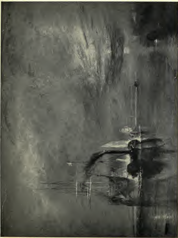
MASTERS IN ART. PLATE V