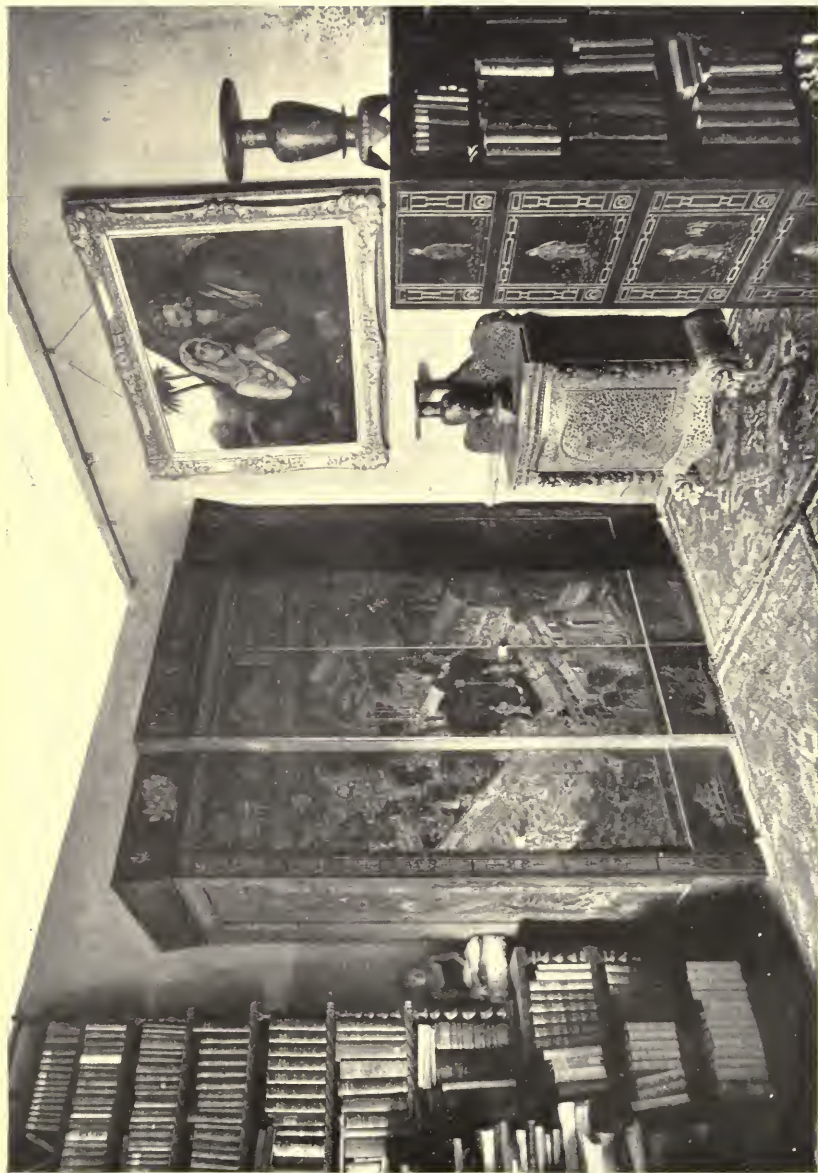
A CORNER IN 'THE PINLS,' SHOWING ONE OF THE CHINESE CABINETS