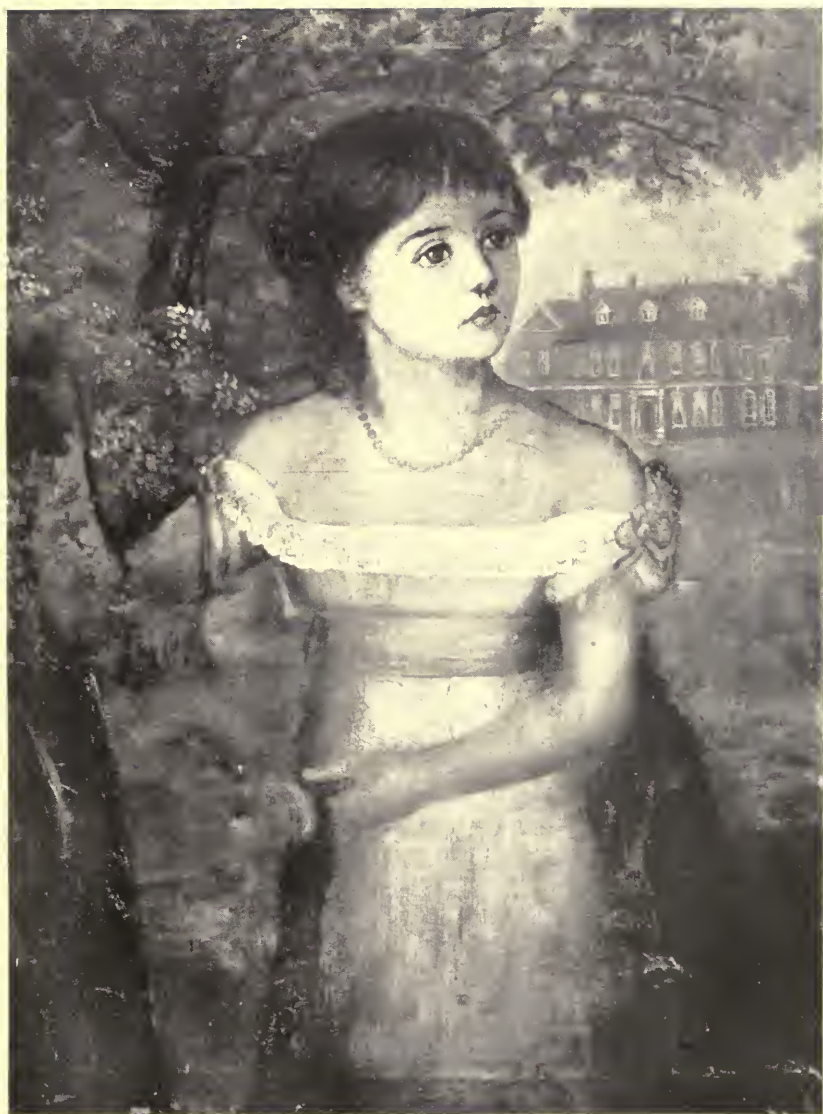
SLEPE HALL ; CROMWELL'S SUPPOSED RESIDENCE AT ST. IVES (From an Oil Painting)