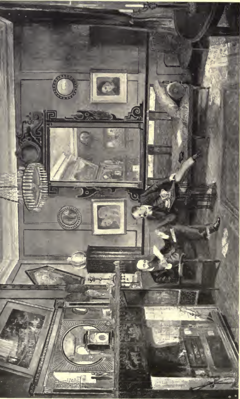
'I found D'Arcy in the Green Dining Room. He read aloud some verses to me.' 'Aylwin,' Chapter V

(From a Water-colour Drawing by Dunn, at 'The Pines')