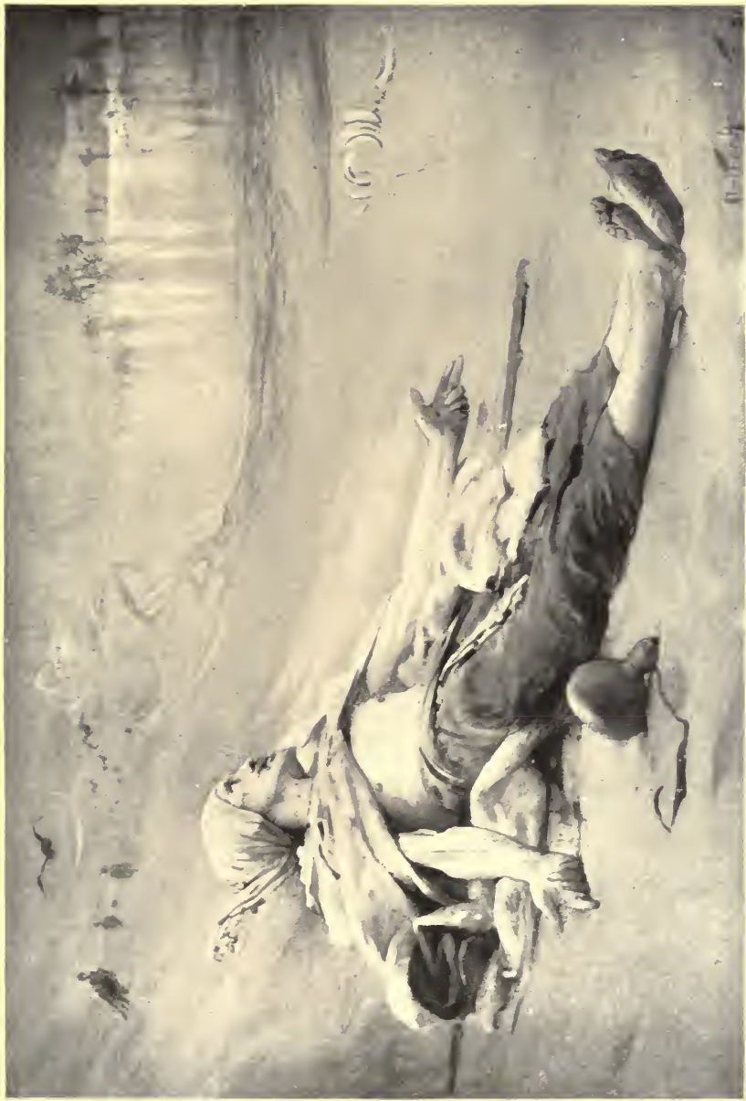
‘JOHN THE PILGRIM? : THE MIRAGE IN EGYPT