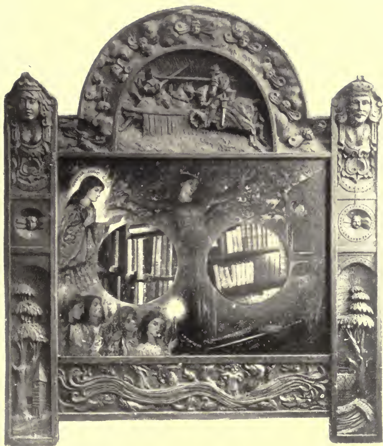
ONE OF THE CARVED MIRRORS AT 'THE PINES,' DECORATED WITH DUNN'S COPY OF THE LOST ROSSETTI FRESCOES AT THE OXFORD UNION