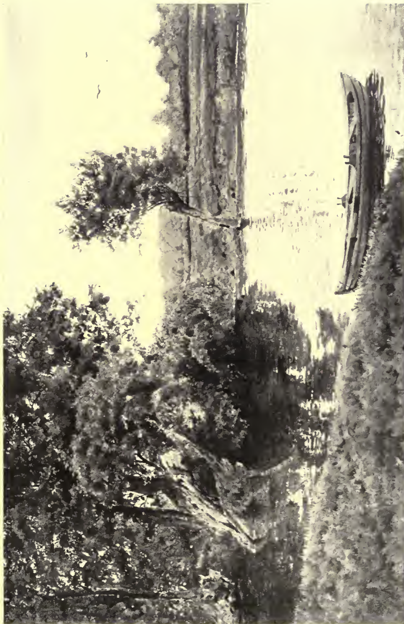
THE OUSE AT HOUGHTON MILL, HUNTS