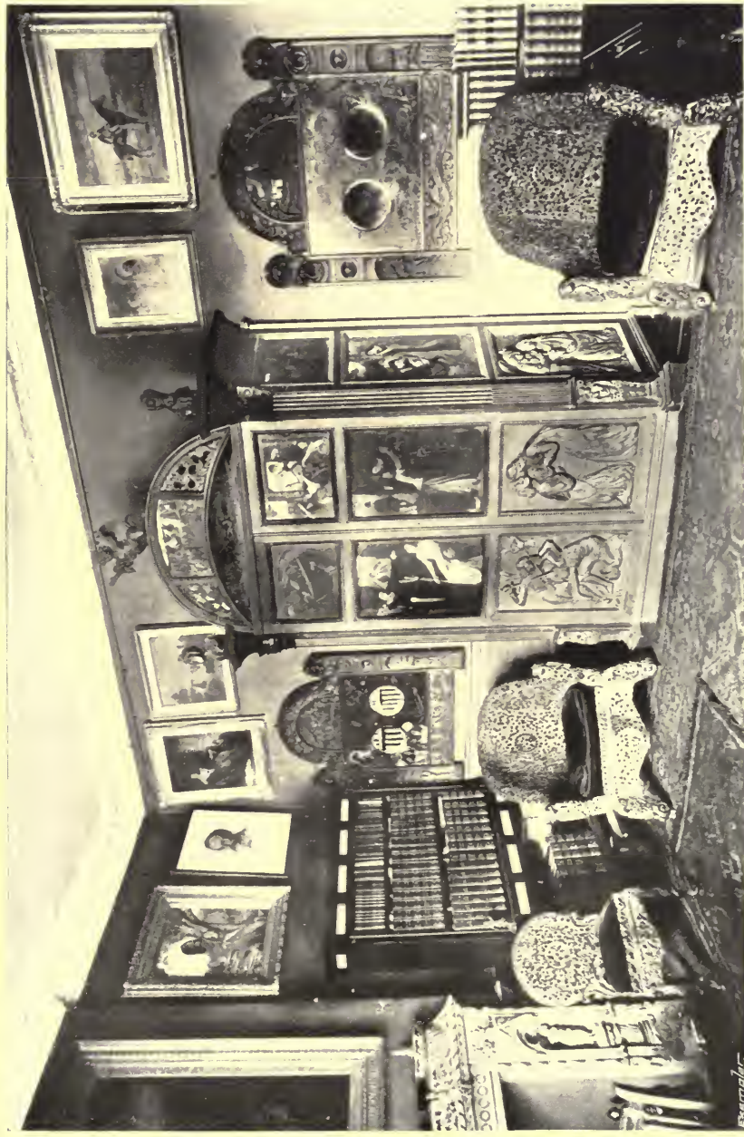
A CORNER IN 'THE PINES,' SHOWING THE PAINTED AND CARVED CABINET