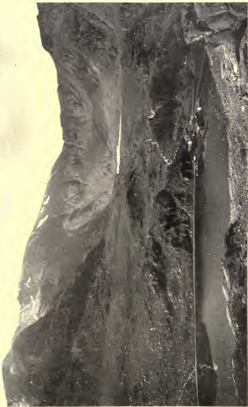
OGWEN AND THE GLYDERS FROM CARVEDD DAFYDD