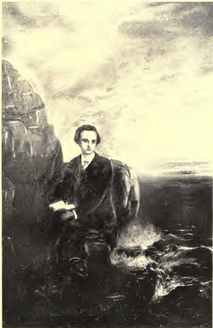
‘EVENING DREAMS WITH THE POETS’ (From an Oil Painting at ‘The Pines’)