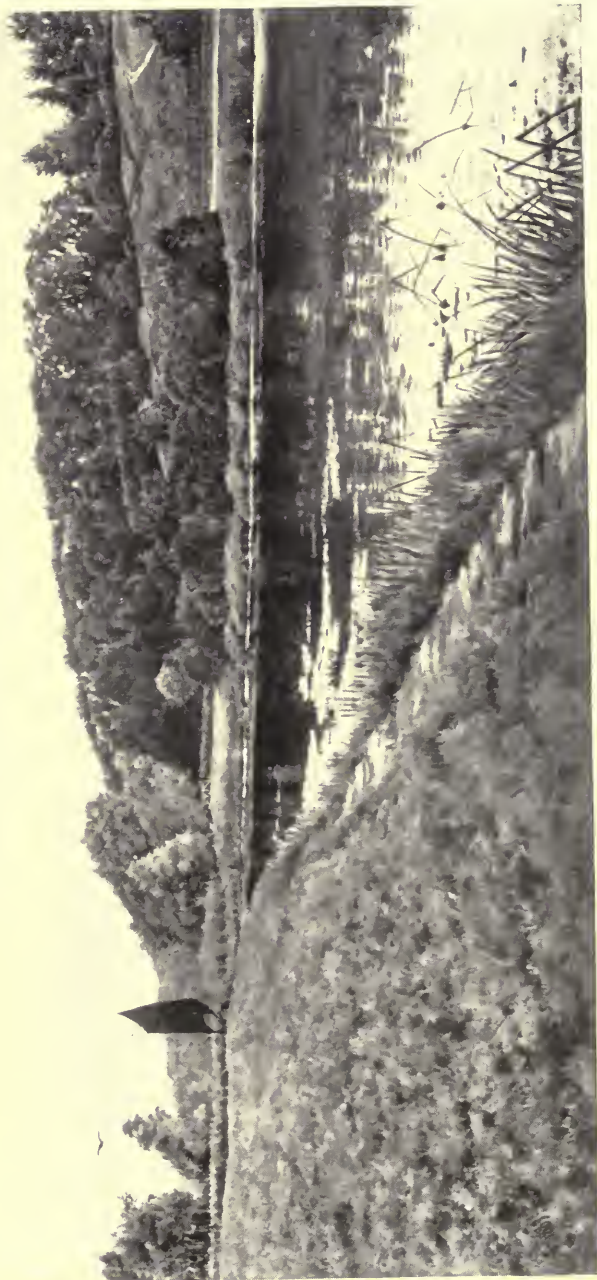
THE THICKET, ST. IVES (From a Water Colour by Fraser)