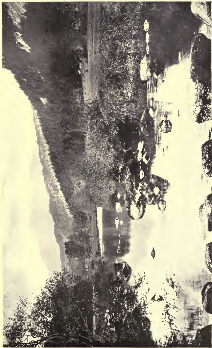
MOEL SIABOD AND THE RIVER I LEDR