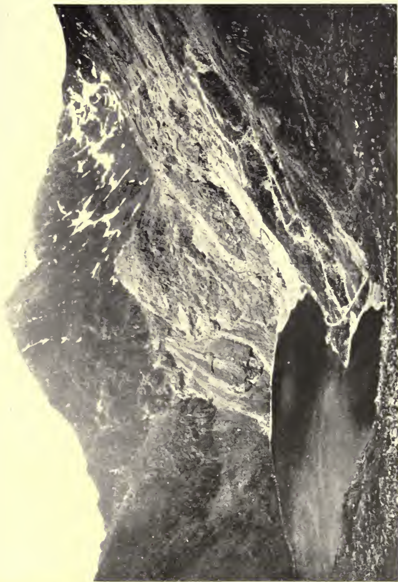
SNOWDON AND GLASLYN