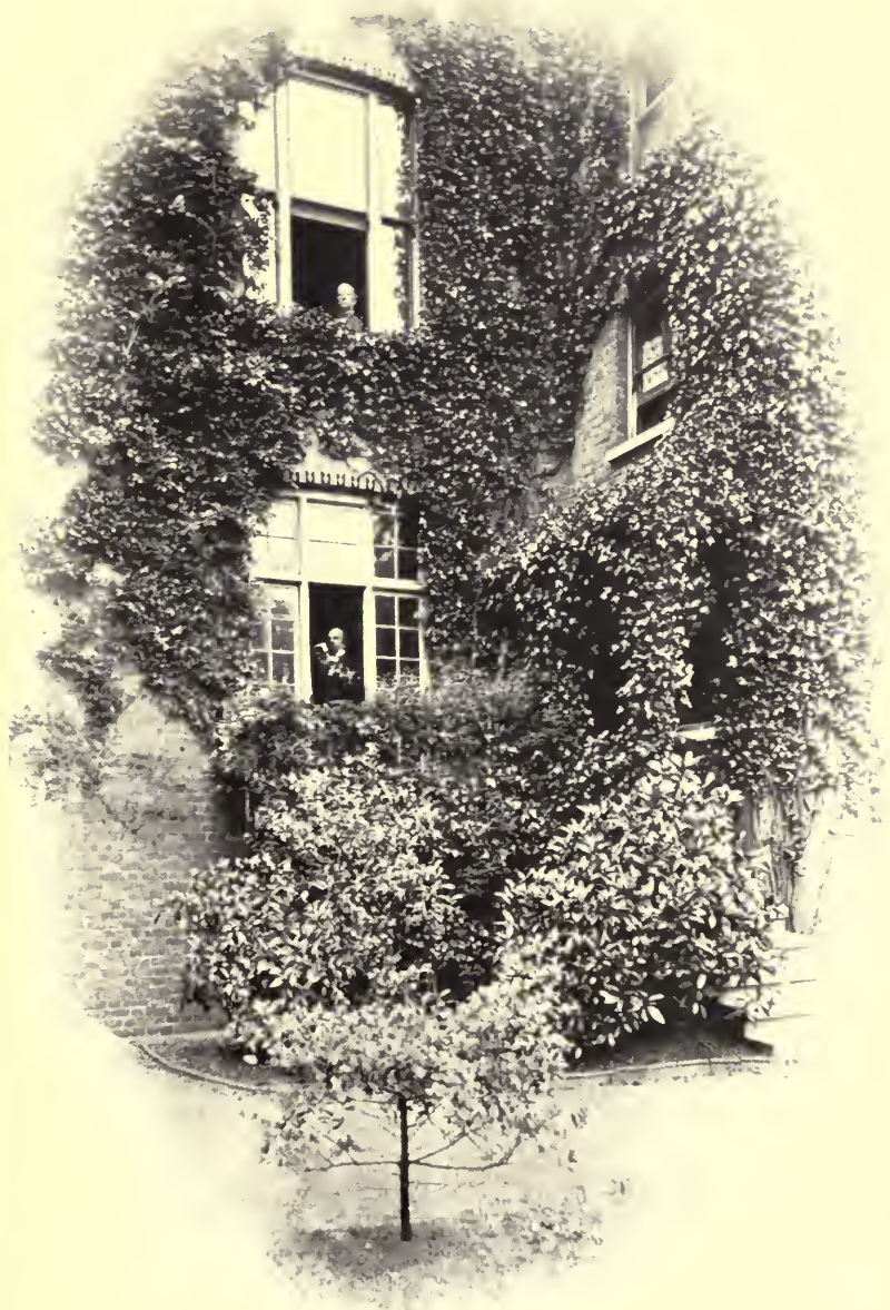
SUMMER AT 'THE PINES.' I