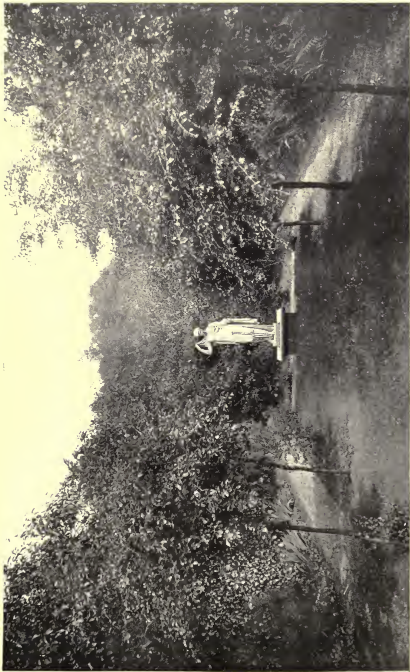
SUMMER AT 'THE PINES,' II