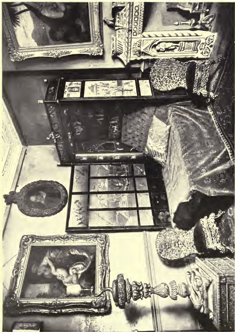
THE CHINESE DIVAN DESCRIBED IN 'AYLWIN'