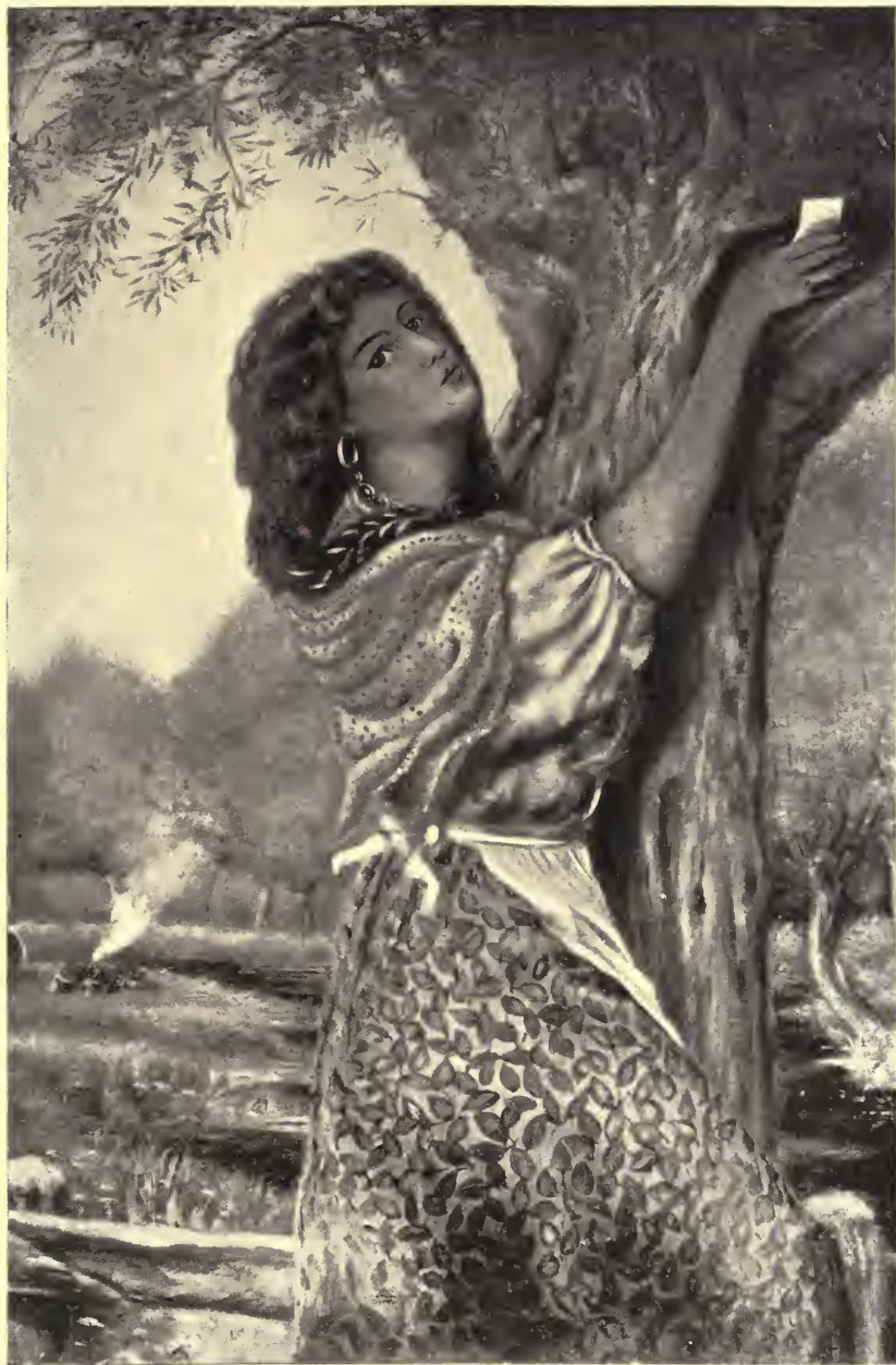
A LETTER BOX ON THE BROADS (From an Oil Painting at 'The Pines')