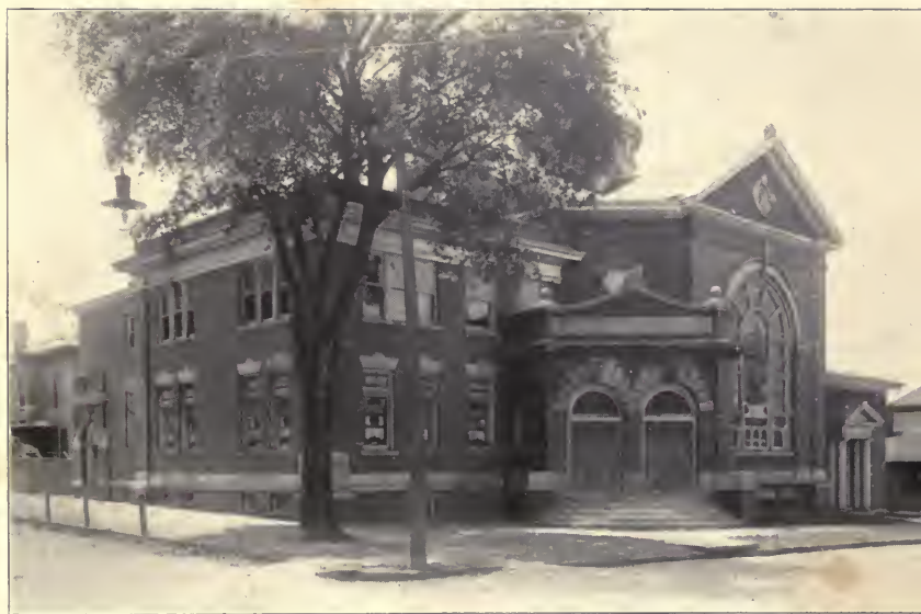
SECOND CHRISTIAN CHURCH.