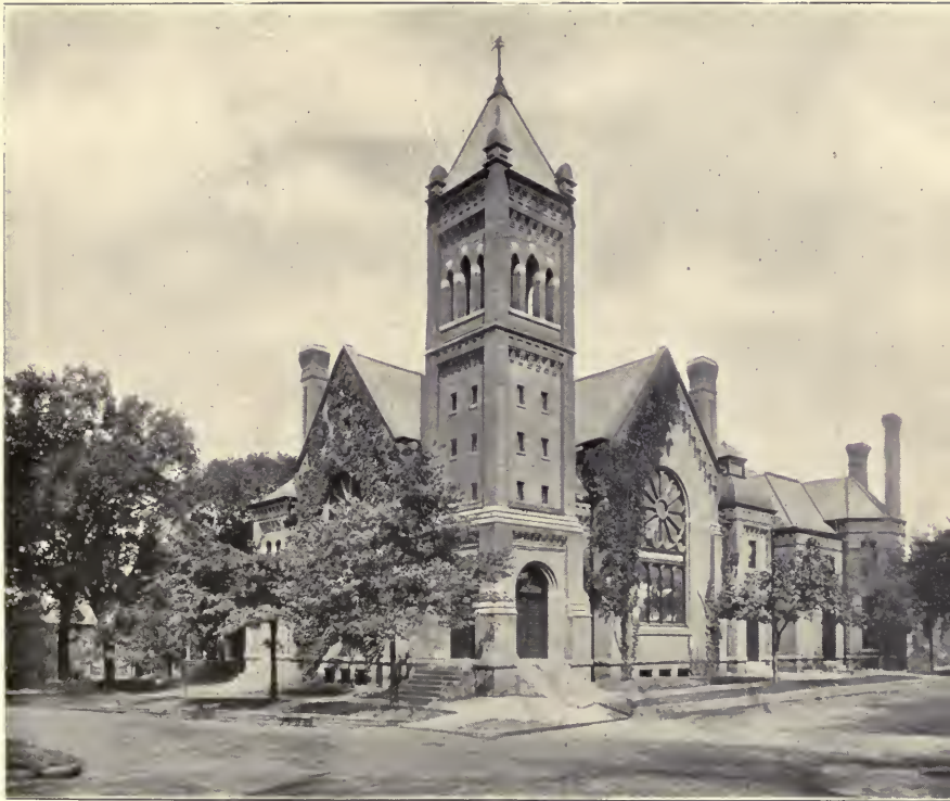
FIRST CHRISTIAN CHURCH