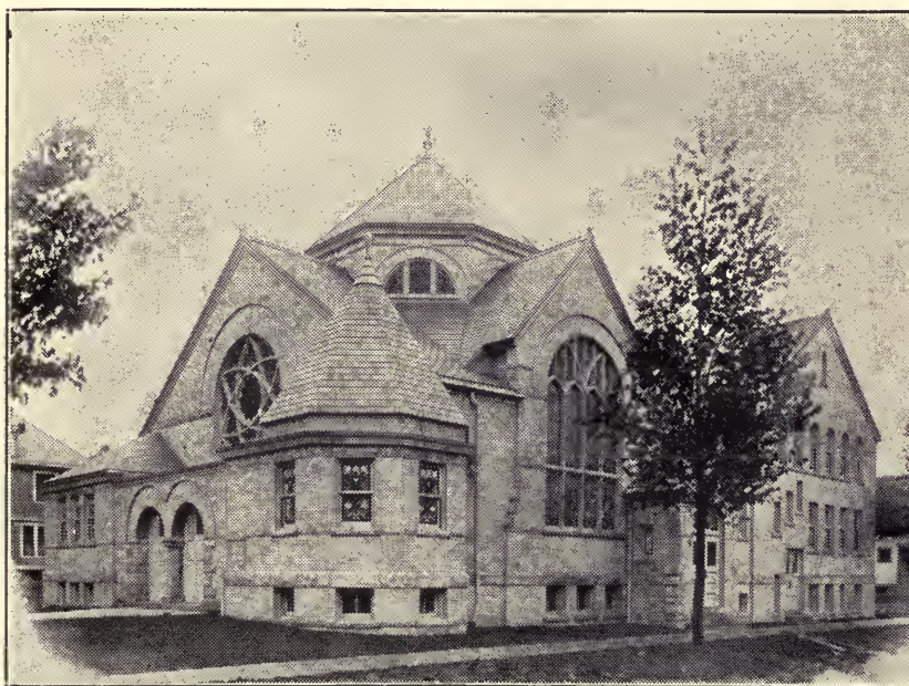
CENTENNIAL CHRISTIAN CHURCH.