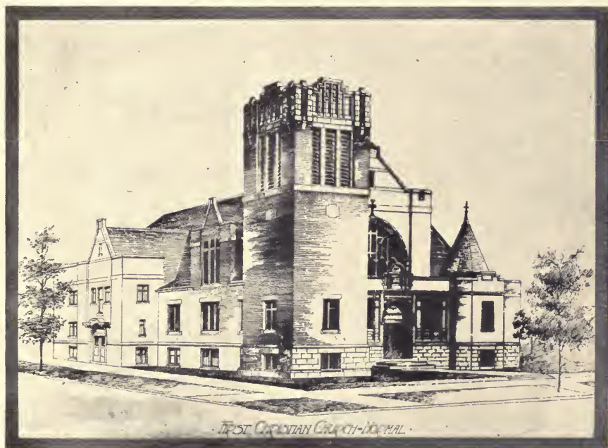
FIRST CHRISTIAN CHURCH, NORMAL