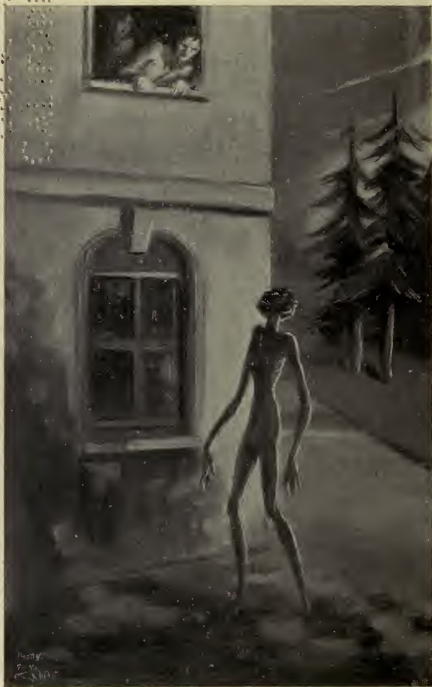
"The Thing came right up to the window, and then raised its face"