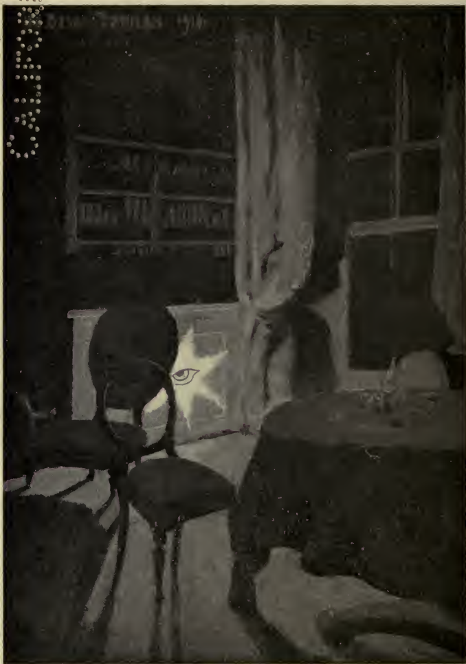
“ I suddenly caught sight of a large eye ”