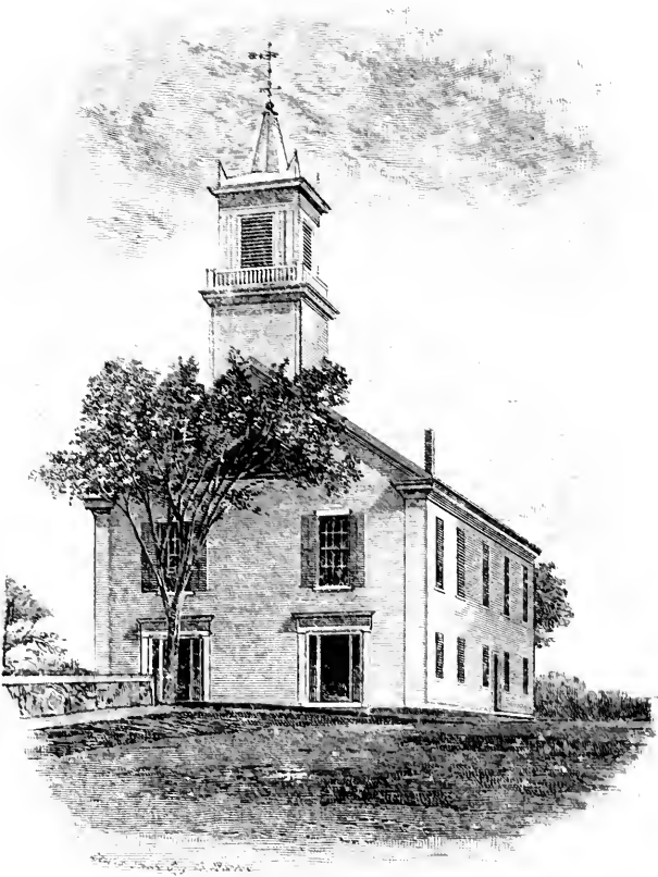
Present Church Edfree -- Erected 1792 Remodeled 1842