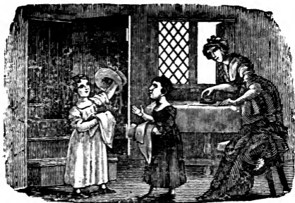
The Pink Bonnet.

at work. "Is this my doll?" "Yes, Ellen," said Mary, "it is the very doll whom you were pitying this morning, because her frock was torn. Don't you think she looks quite genteel?" "Yes, I am sure she does," said Ellen. "What a pretty pink bonnet this is, and this beautiful frock, and these little cunning green slippers; you didn't make them all , did you?"