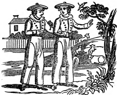
Rambling about the Farm.

a wolf, a spotted panther, a white bear, and other wild beasts.