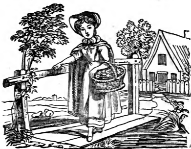
The Water-Cress Girl.

grandmother, she always took great care to make the bed, sweep up the hearth, and draw her grandmother's elbow chair into the warmth of the sun, that she might sit there in ease, till her return from the houses where she was in the habit of calling with her basket of water-cresses; and as Susan was known to be such a good girl, she did not want for friends, who were always glad to buy of her. A