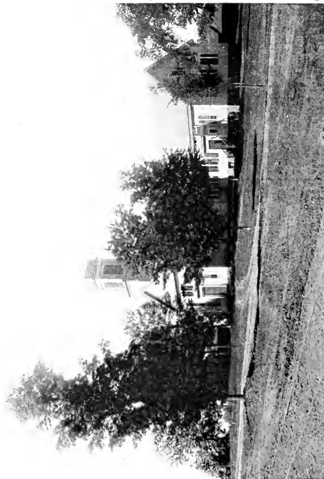
CONGREGATIONAL CHURCH NEWINGTON, CONNECTICUT