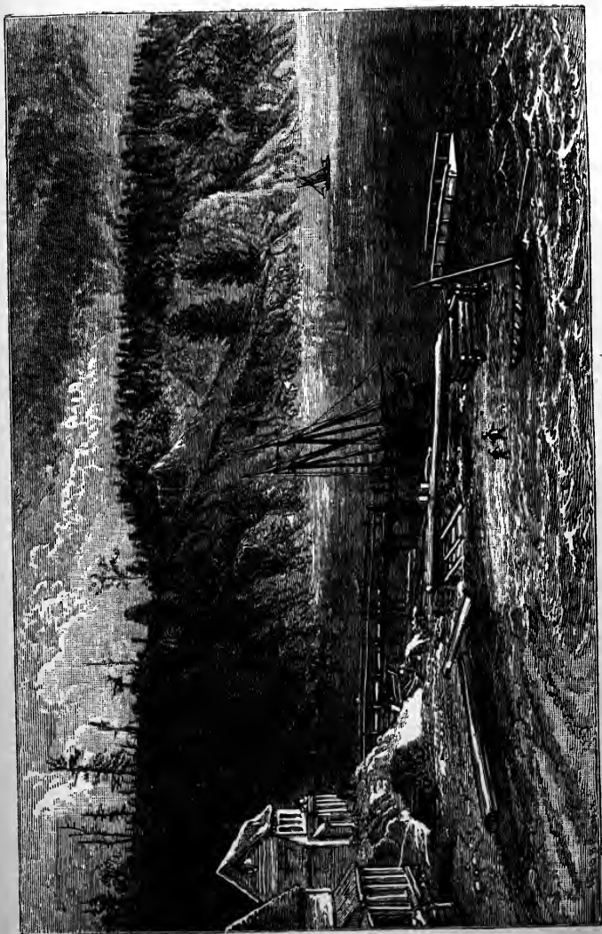
Newport Pier, 1879.