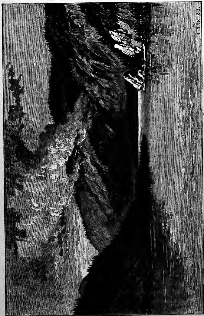
Columbia, above the Lower Cascade.