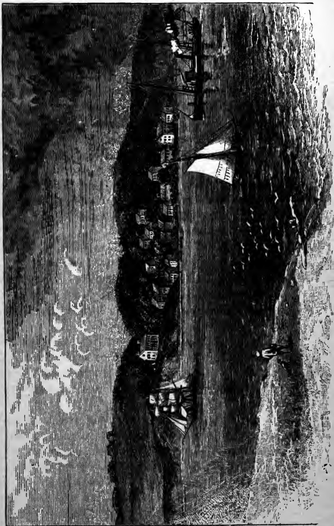
Yaquina Bay, Newport, 1880.