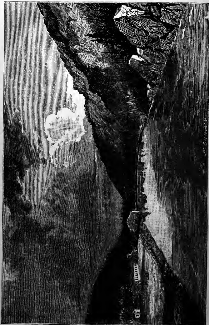
The Columbia Cascades Landing (Looking up stream).