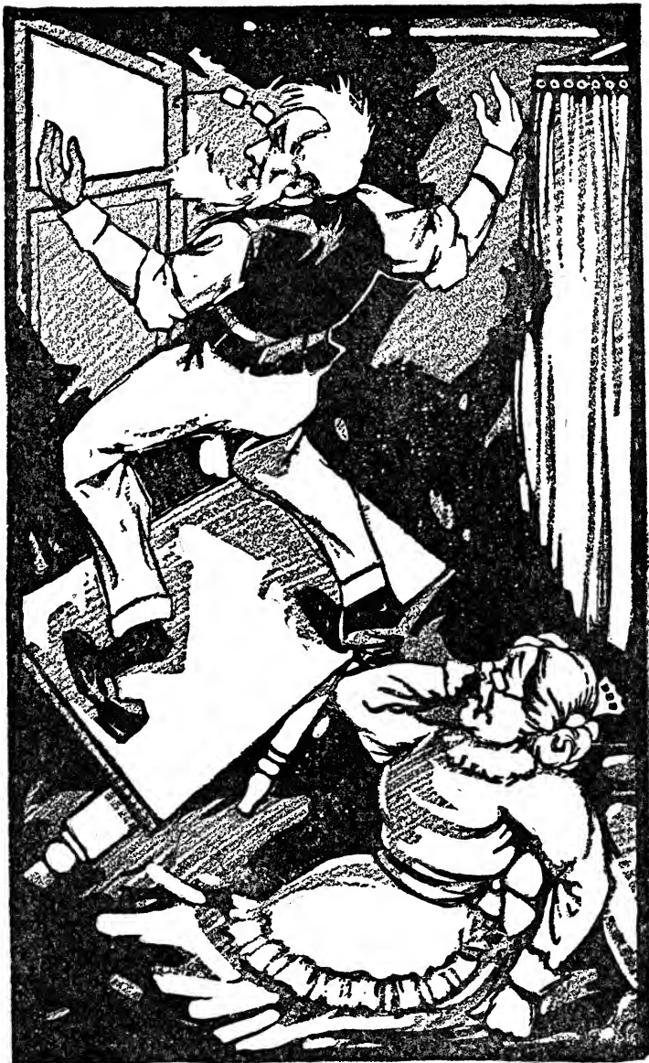
DOWN IT CAME WITH ALL ON BOARD.