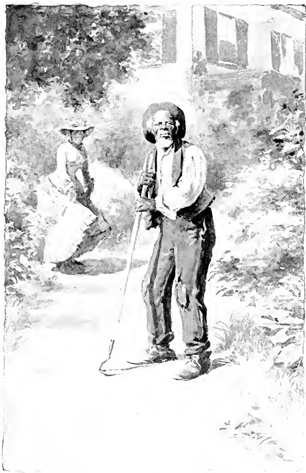
UNCLE REMUS . . . SNIFFING THE AIR. Page 258.