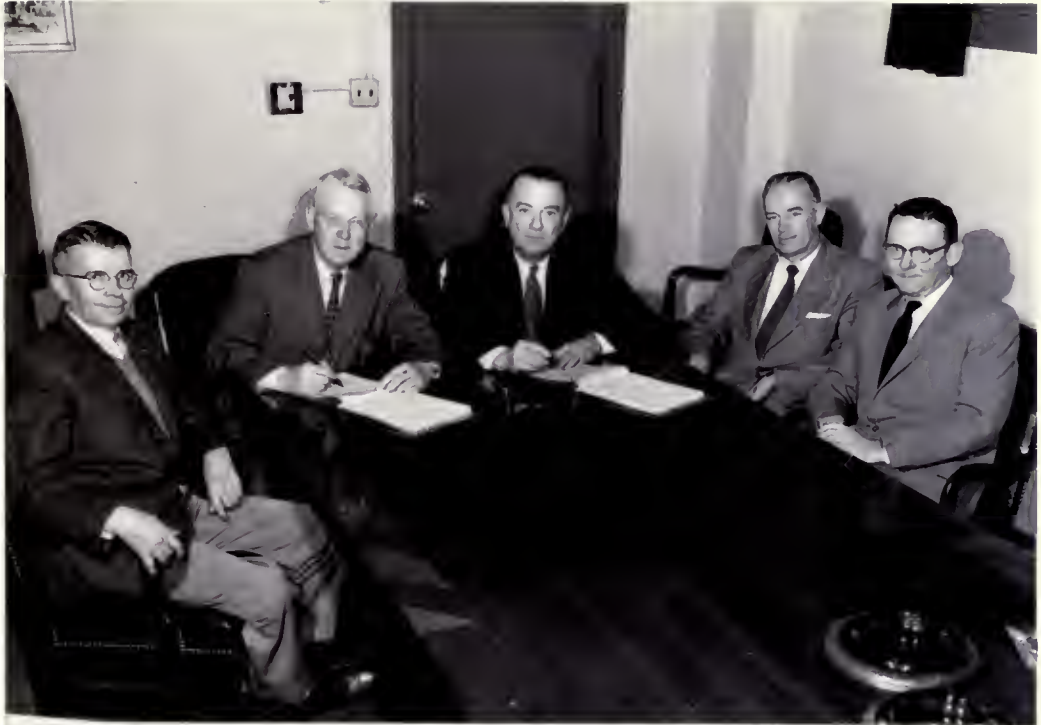
The signing of the Atomic Energy Commission and University of California 5-year contract for the operation of the Los Alamos Scientific Laboratory. April 3, 1957