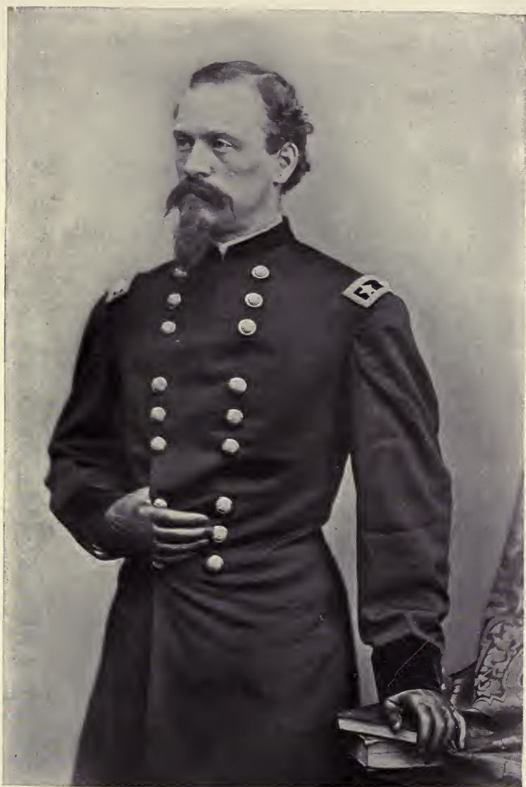
James Harrison Wilson Major General U. S. A.