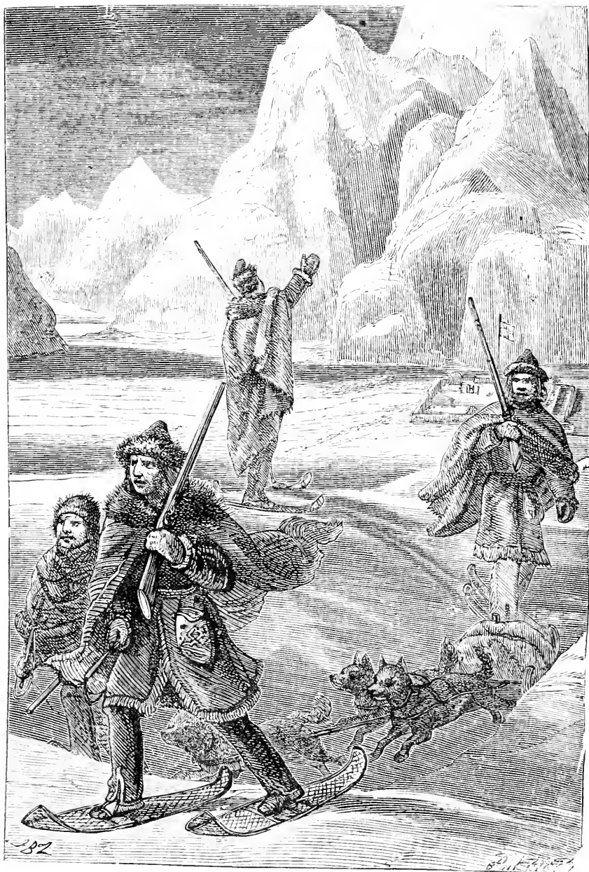
FRANK'S FAREWELL TO UNGAVA.