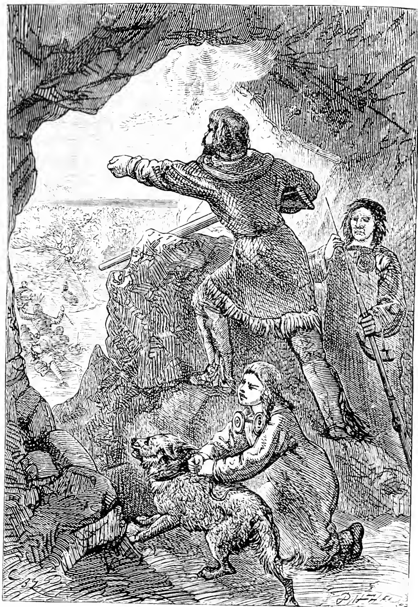
MAXIMUS'S DEFENCE OF THE CAVE.