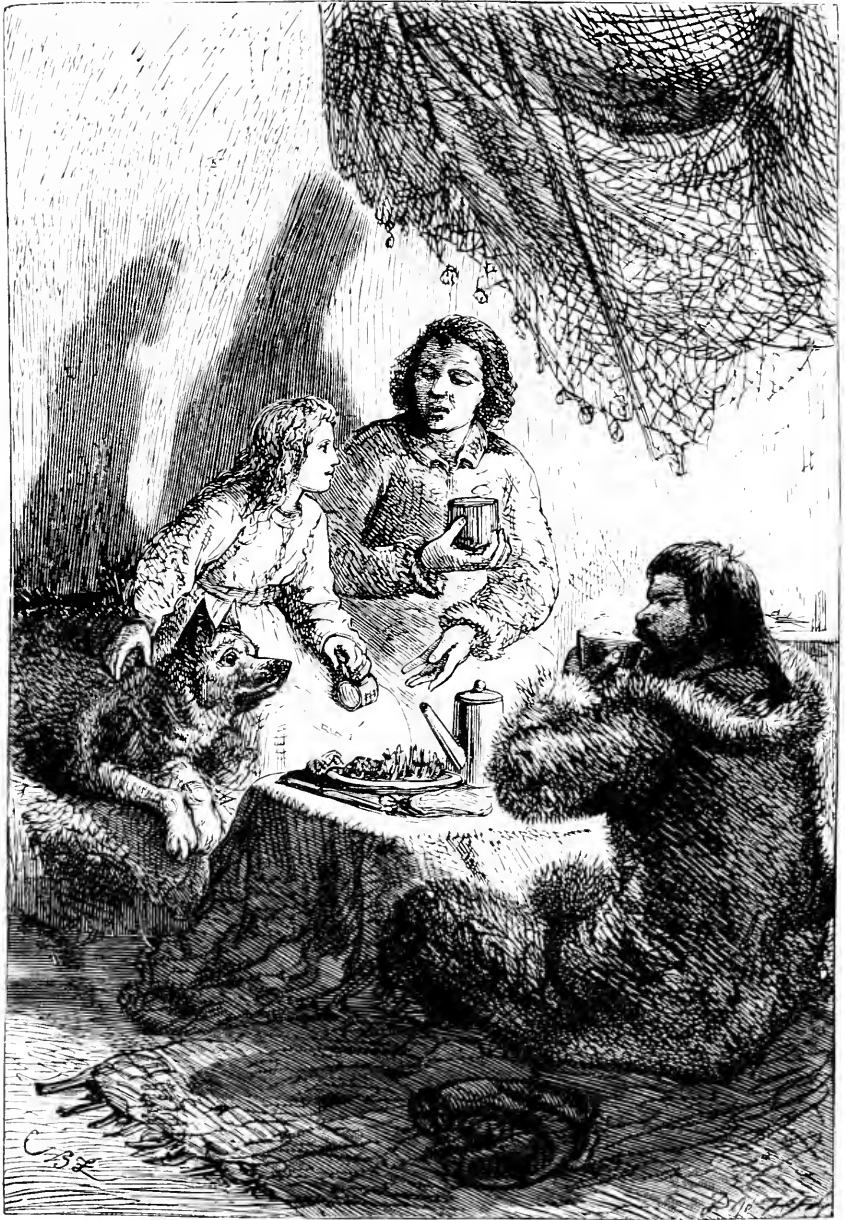
SUPPER IN THE SNOW-HOUSE