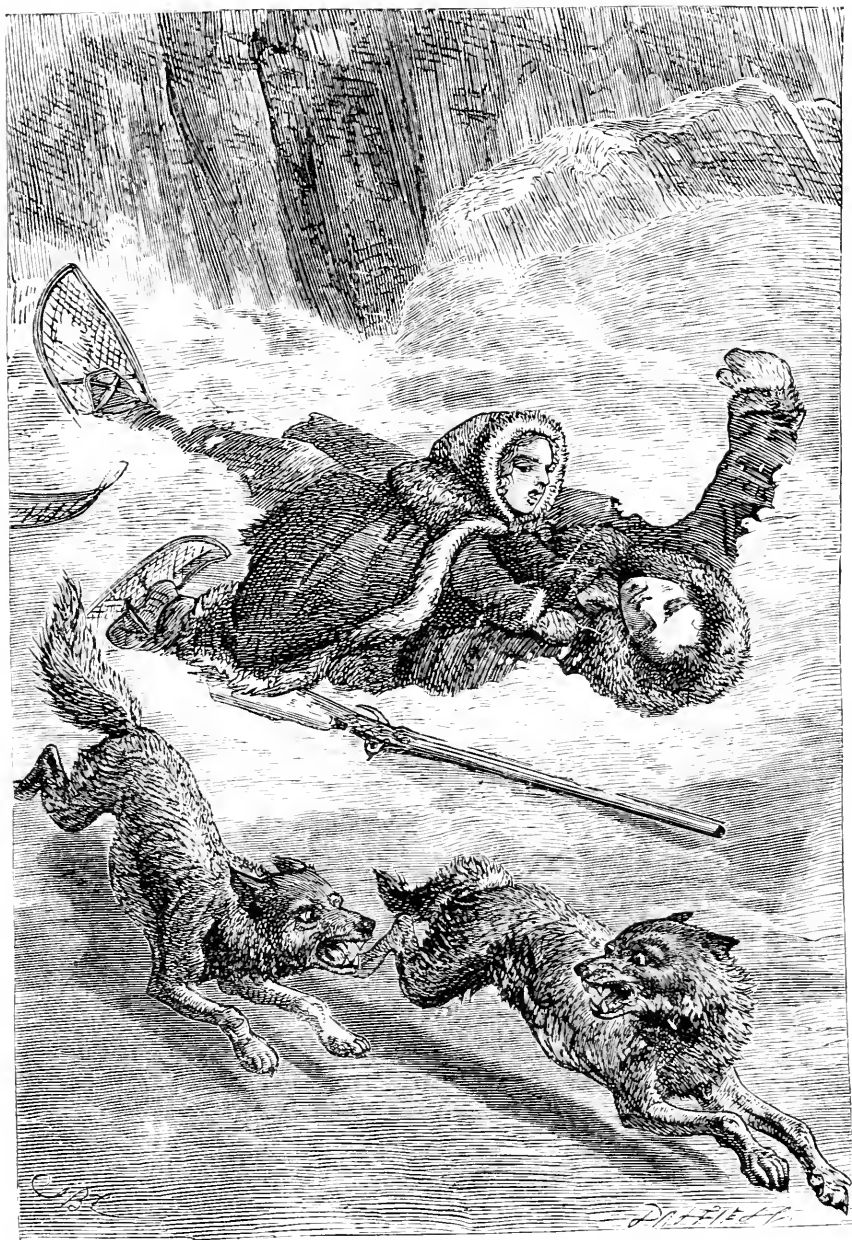
RESCUE OF FRANK MORTON.