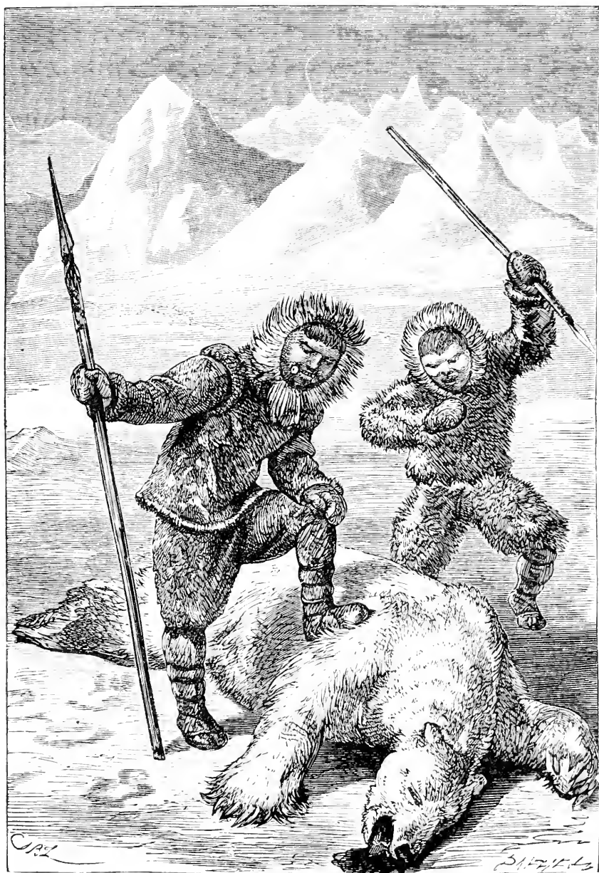
PEETOOT'S JOY OVER THE DEAD BEAR.