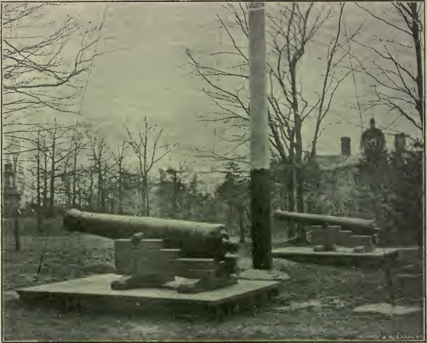
The Cannon—Looking East towards the Queen's Park.

The offer was of course thankfully accepted, and the interesting relic is now in the possession of the President. It is to be placed in the