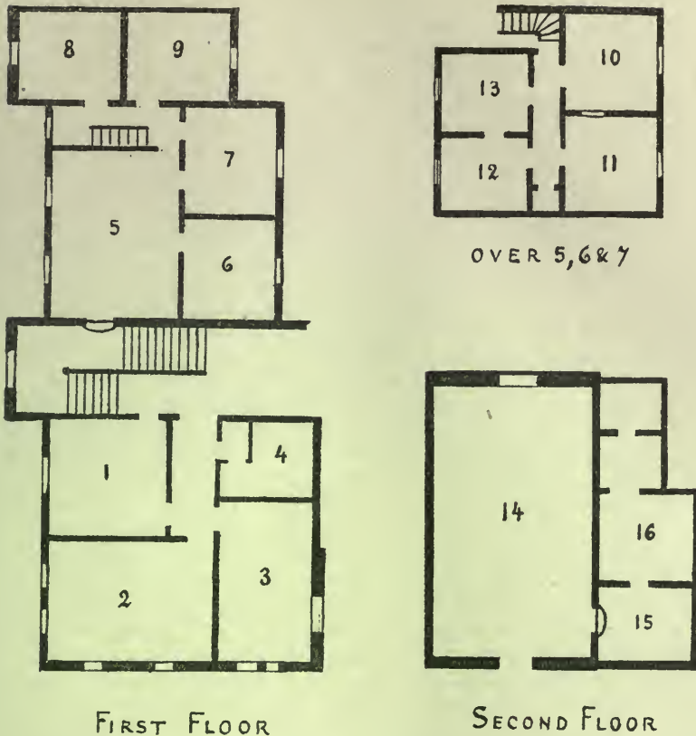
Plan of the Psychological Laboratory of the University of Toronto.