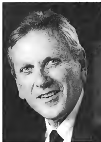
Dr. Leighton Ford

The Story - Just Tell It was the theme of the joint OBC/OTS missions conference held from February 7-9. This was a special focus and celebration since the institution was celebrating its 100th