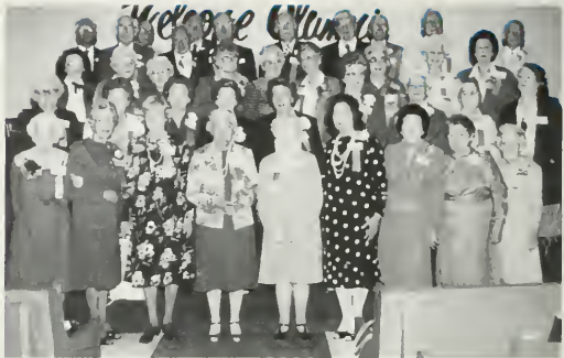
Class of '36 - Golden Milers