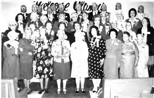
Class of '56 Golden Milers