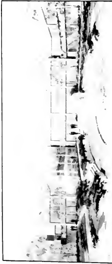
Here's a concept of new OTS building.

To see 30 people gathered in the cafeteria is not an unusual sight. So what made this occasion different? The answer lies in who was there and why. On Thursday evening, June 15 our neighbors were invited to come and learn about our plans to construct a new Seminary building.