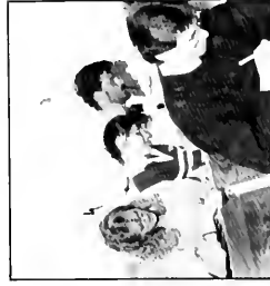
Improvements in existing facilities will make a vast difference in student life and in the quality of resources for study.