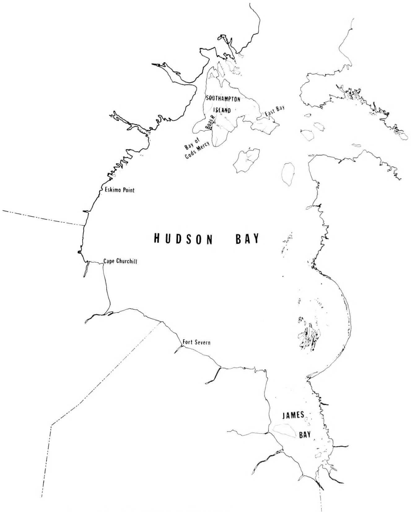
Fig. 1.—Hudson and James Bays, showing locations of study areas and features discussed in the text.