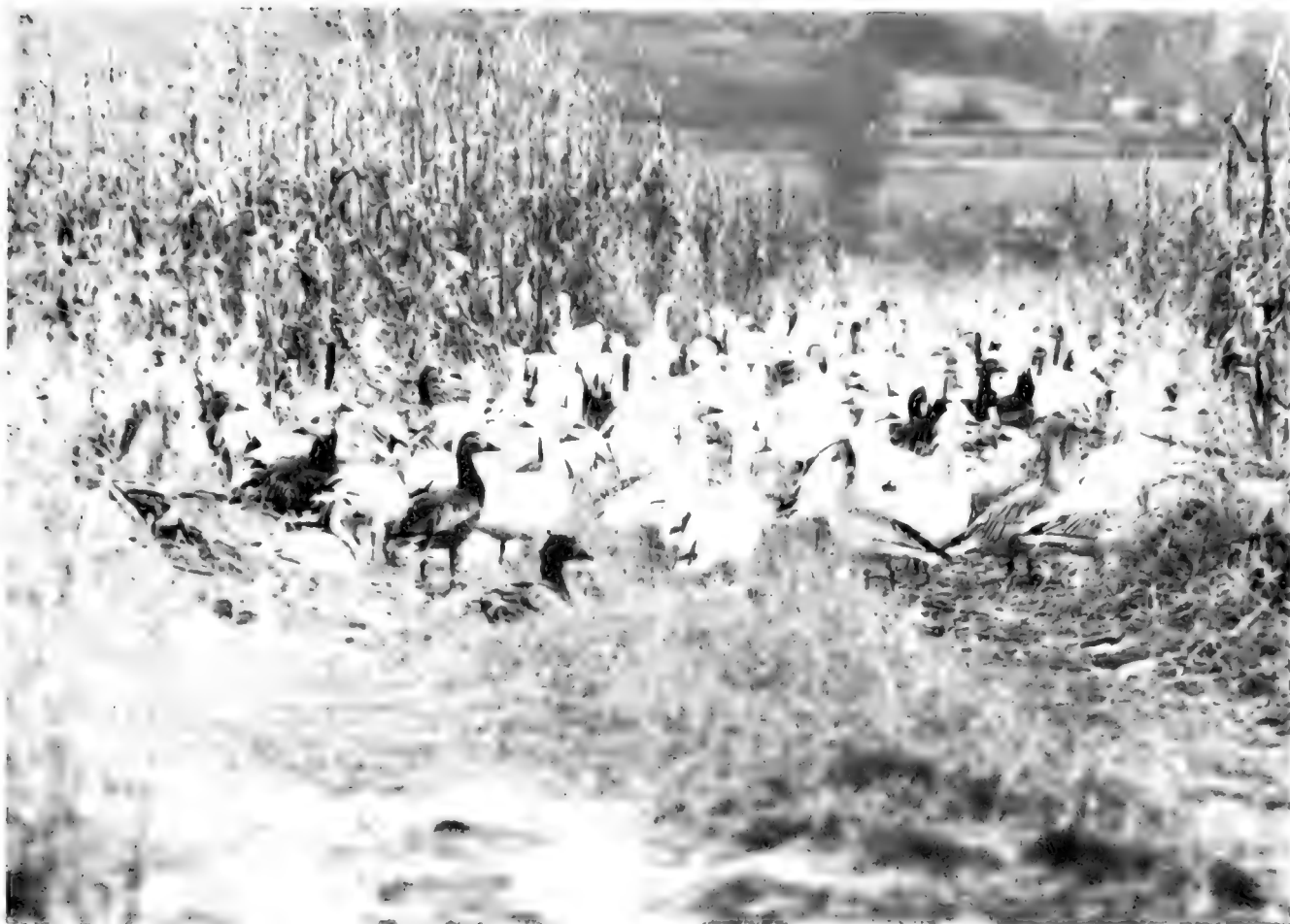
Fig. 2.—Lesser snow and blue geese in a cornfield on the Squaw Creek National Wildlife Refuge in northwest Missouri. The changing habits of these geese and increasing kills made by hunters at points along the migration routes emphasize the need for better information about the origins of such populations.

of poultry. Fortunately the primary feathers from these geese, which were sacrificed, were saved, partly because it was noted at the time that they had not developed normally, being more curved and "foreshortened" than feathers of normal wild birds. Therefore it was of interest to note that the feathers of all three experimental groups of geese revealed much lower contents of most of the minerals we analyzed for than were found in any wild populations thus far studied. These findings suggest that an ultimate of economy in the design of poultry rations may have been approached, but the data also raise the question of whether or not the highly enriched diets of wild birds could play a role in their tremendous vigor and recuperative powers.