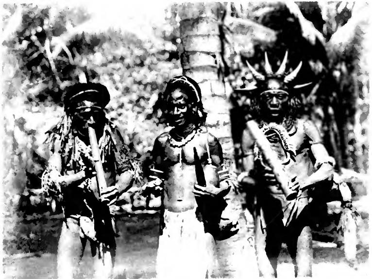
ENJOYING A SMOKE AFTER THE DANCE. THE SHORT CIGARETTE MAY BE SEEN IN THE HOLE NEAR THE LOWER END OF THE PIPE. GONA BAY, N. E. PAPUA.