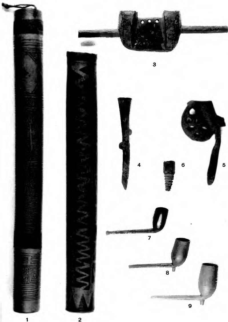
1, BAMBOO PIPE WITH INCISED DESIGNS, MEKEO DISTRICT, PAPUA. 2, BAMBOO PIPE WITH BURNT DESIGNS. THE SMALL HOLE IS NEAR THE UPPER END, CENTRAL DISTRICT, PAPUA. 3-6, WOOD PIPES, ARFAK MOUNTAINS, DUTCH NEW GUINEA. 7-9, CLAY PIPES, BUKA, SOLOMON ISLANDS.