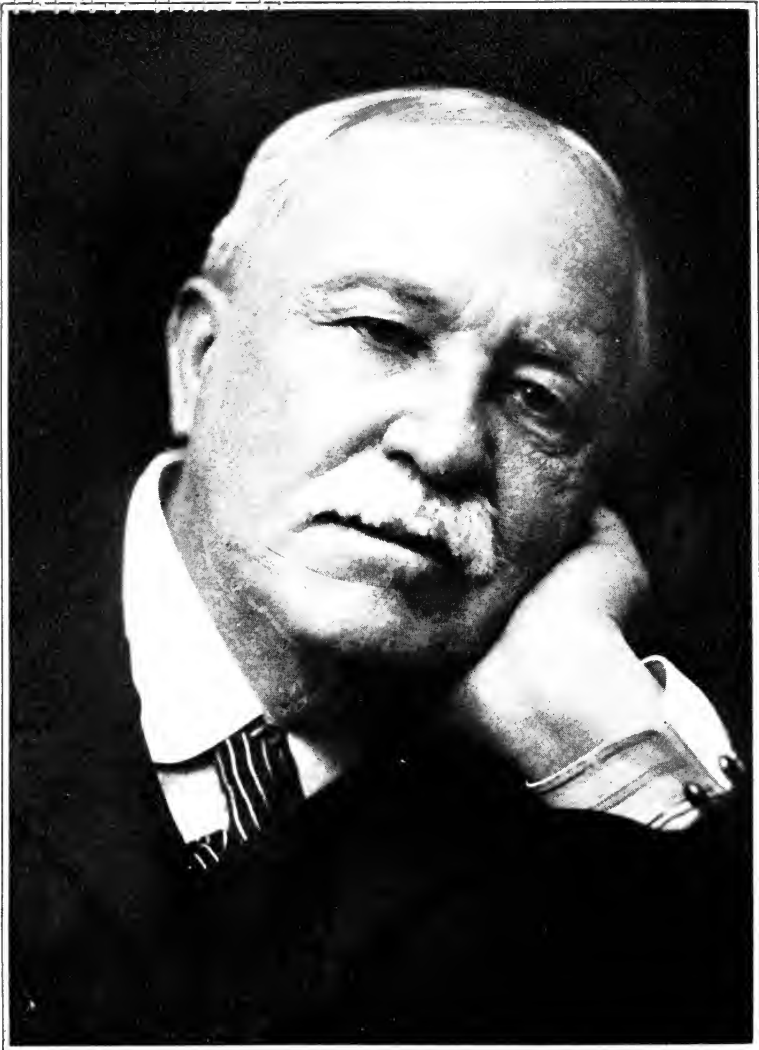
WILLIAM DEAN HOWELLS