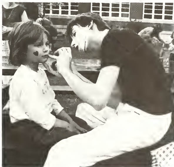
A very patient little girl is having her face painted at one of the many activities at the festival.

The 18th Annual Spring Arts Festival held in April provided students and community residents another fun-filled weekend of entertainment, food, and exhibits by artists from the local area.