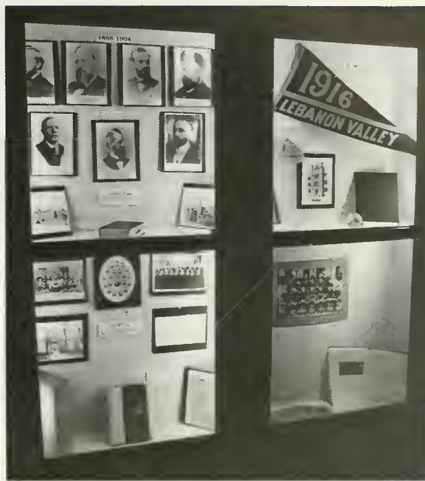
The Honors Class of 1990 received so many artifacts from alumni during their study that they decided to put together this permanent display in the foyer of the College's Administration Building.

For some reason, when it got down to specifically mapping out the semester, we'd had a change of heart. A staged murder, no matter how realistic, is a far cry from the real thing. We went back to what had caught our attention in the first place — the lure of the old LVC. What really interested us was the sense of a hidden tradition. All of this time we had thought of Lebanon Valley College as only some static institution, with lit-