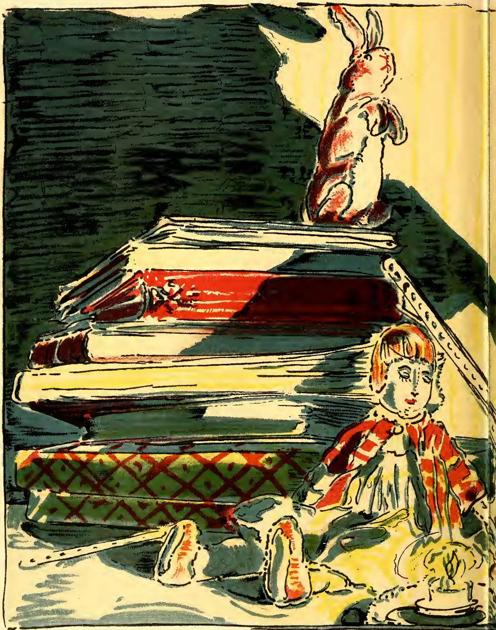
The Skin Horse