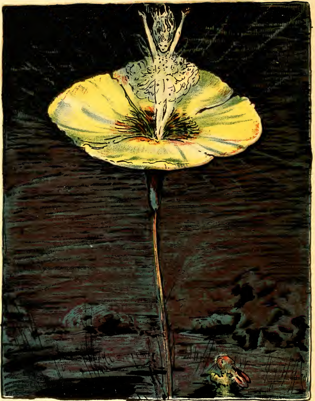
The Fairy flower