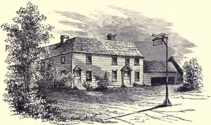
THE CATAMOUNT TAVERN.

Here were the headquarters of the "Green Mountain Boys" when they met to devise plans for the protection of their families and their once paid for homes from the rapacity of the land jobbers and speculators of New York, known to them as "Yorkers." In this tavern, also, was the room which was occupied for years by the Vermont Council of Safety. The sign was a stuffed catamount skin, upon a high pole, with jaws grinning towards New York. The tavern was built about 1769 and destroyed by fire March 30, 1871.