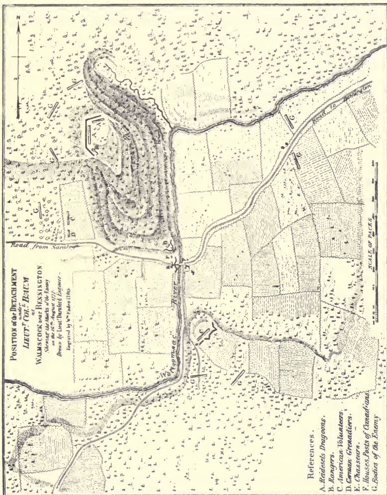
MAP OF BENNINGTON BATTLE.