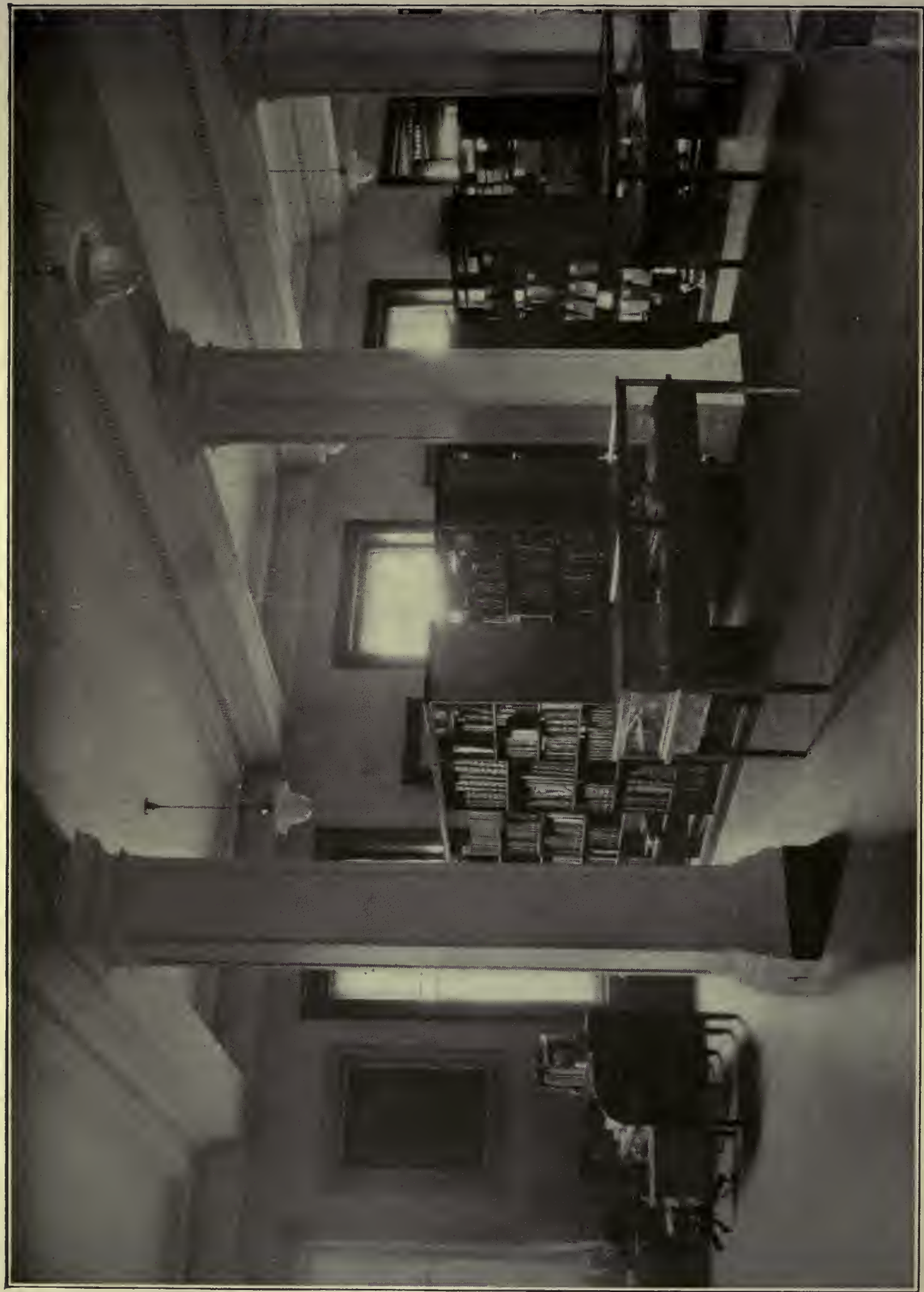
VERMONT HISTORICAL SOCIETY