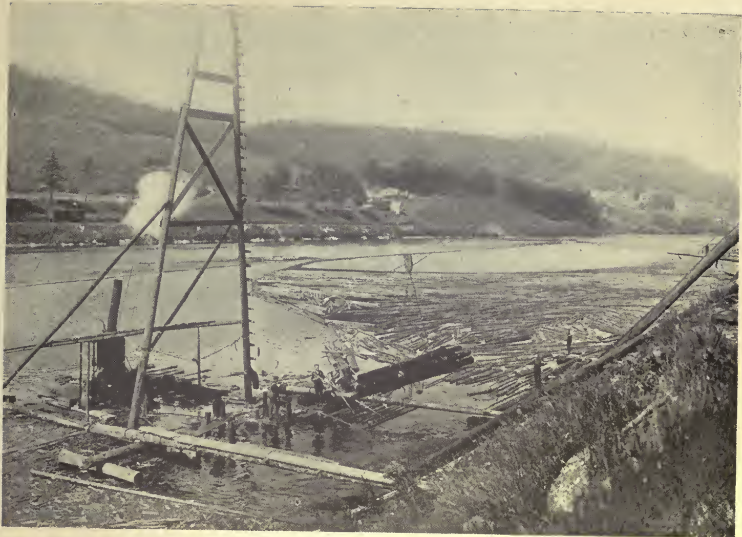
REMOVING LOGS FROM THE RIVER—INTERNATIONAL PAPER CO., BELLOWS FALLS