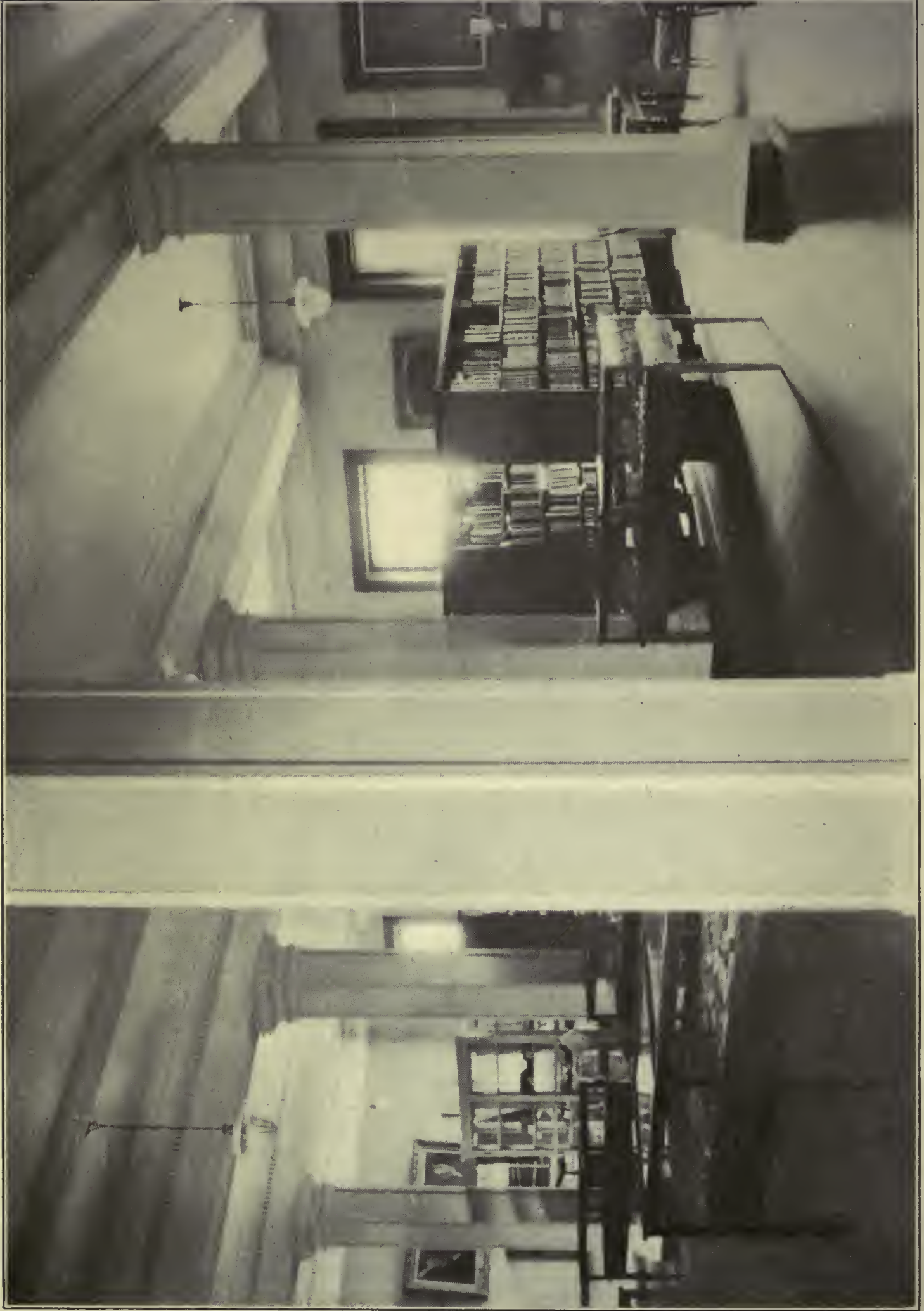
VERMONT HISTORICAL SOCIETY