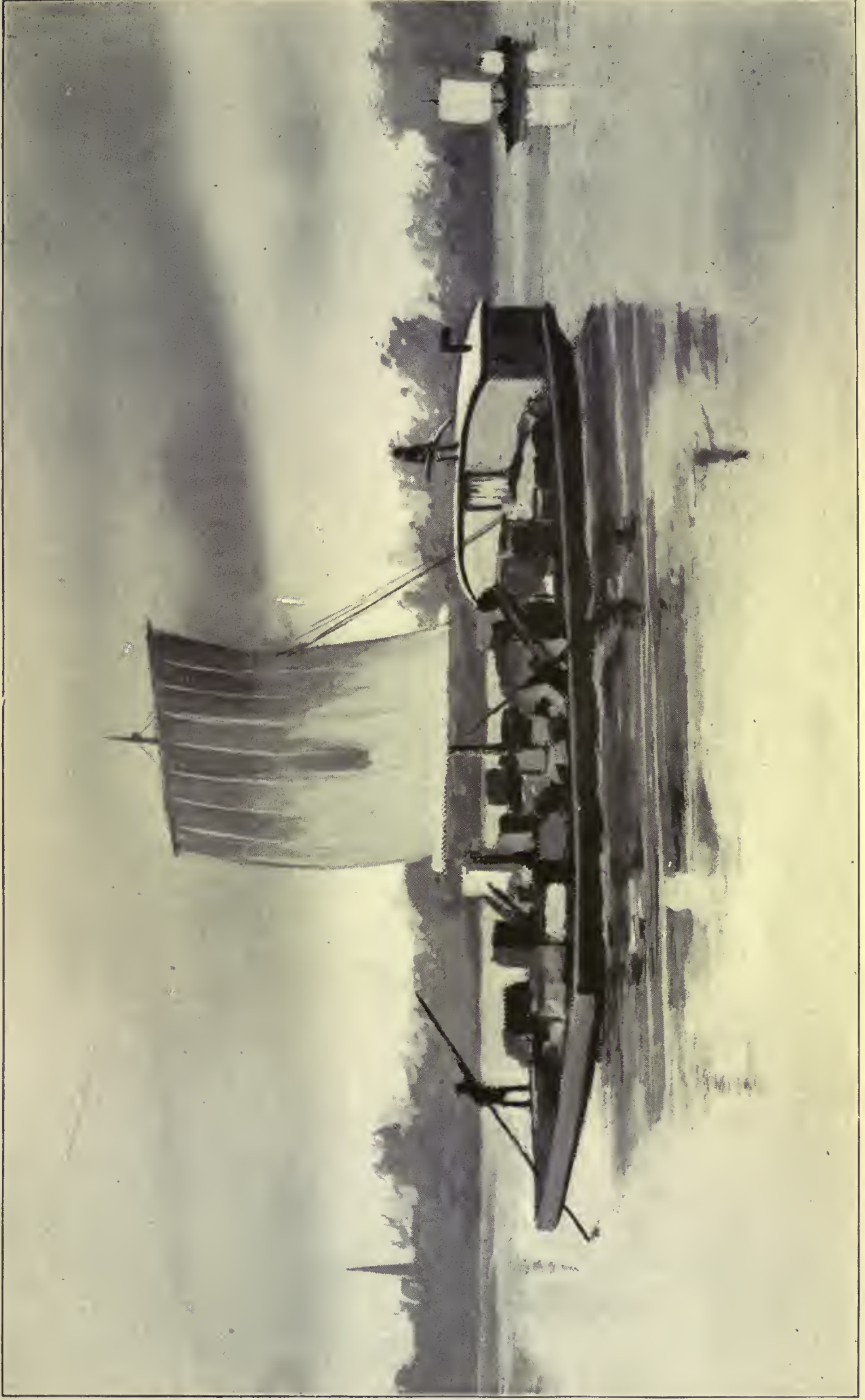
A FLAT BOAT ON THE CONNECTICUT RIVER IN THE FIRST HALF OF THE NINETEENTH CENTURY