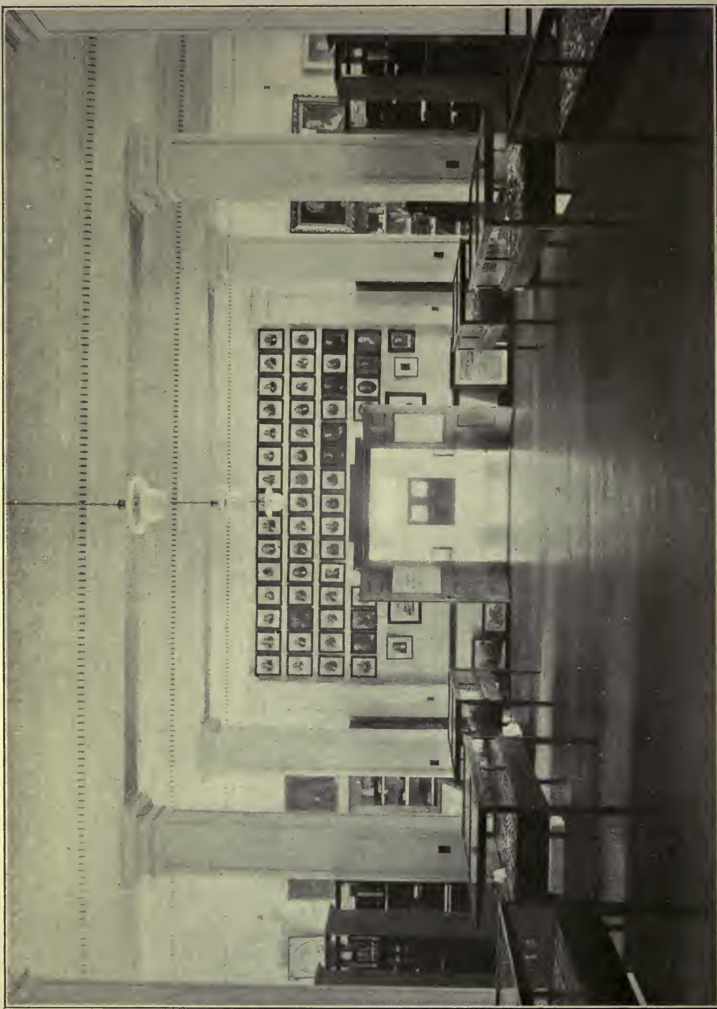
VERMONT HISTORICAL SOCIETY