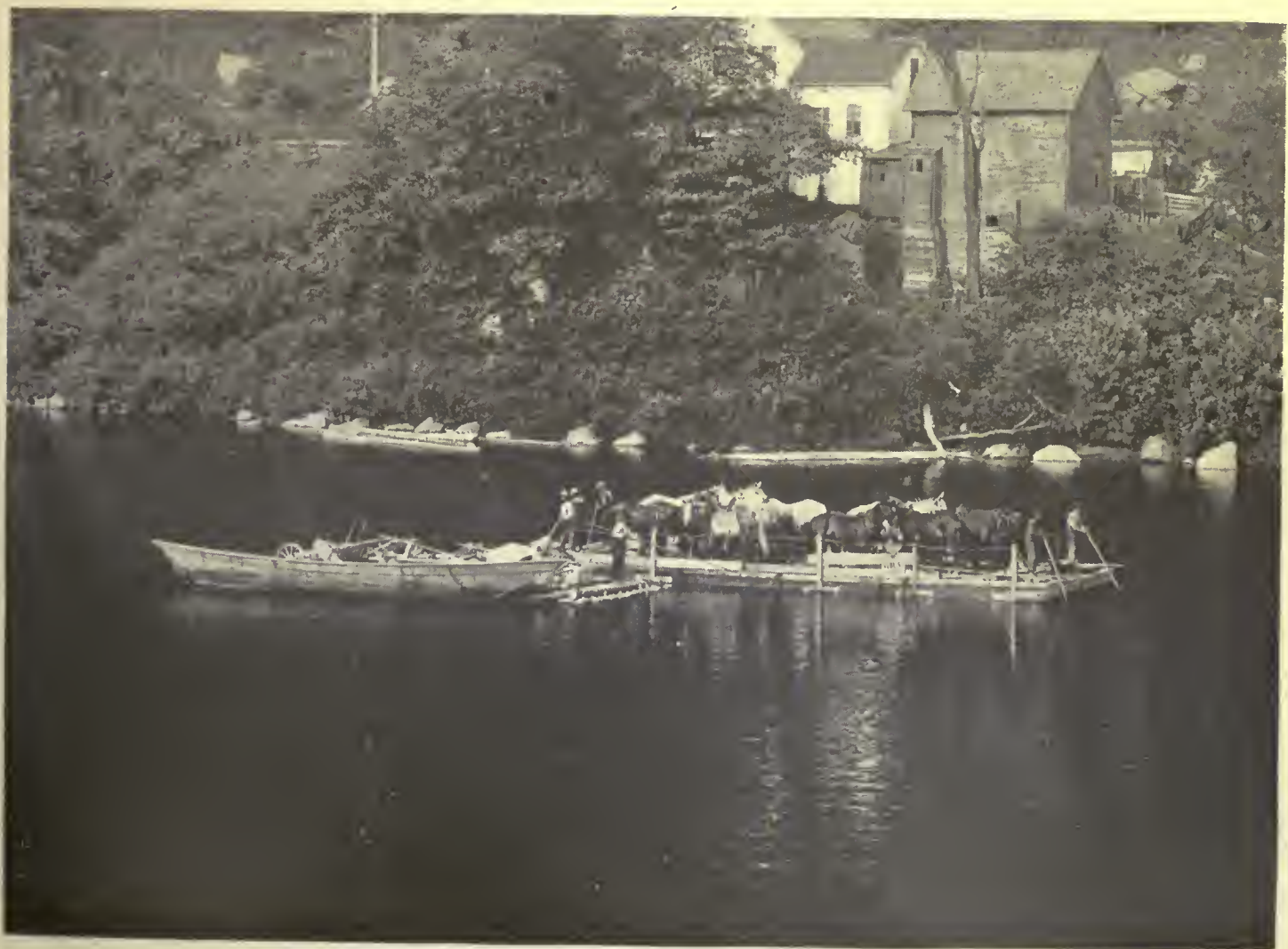
THE VAN DYKE LOGGING OUTFIT MOVING DOWN THE RIVER