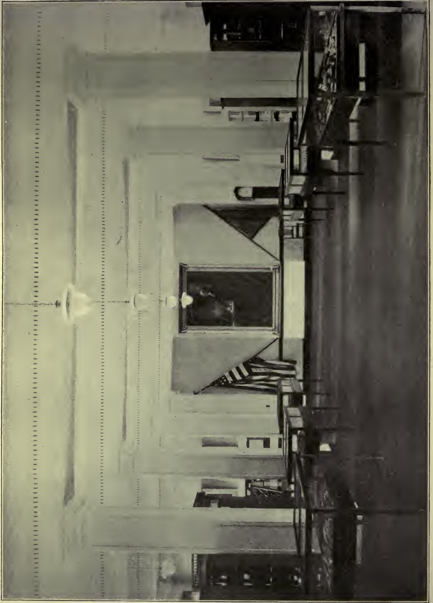
VERMONT HISTORICAL SOCIETY