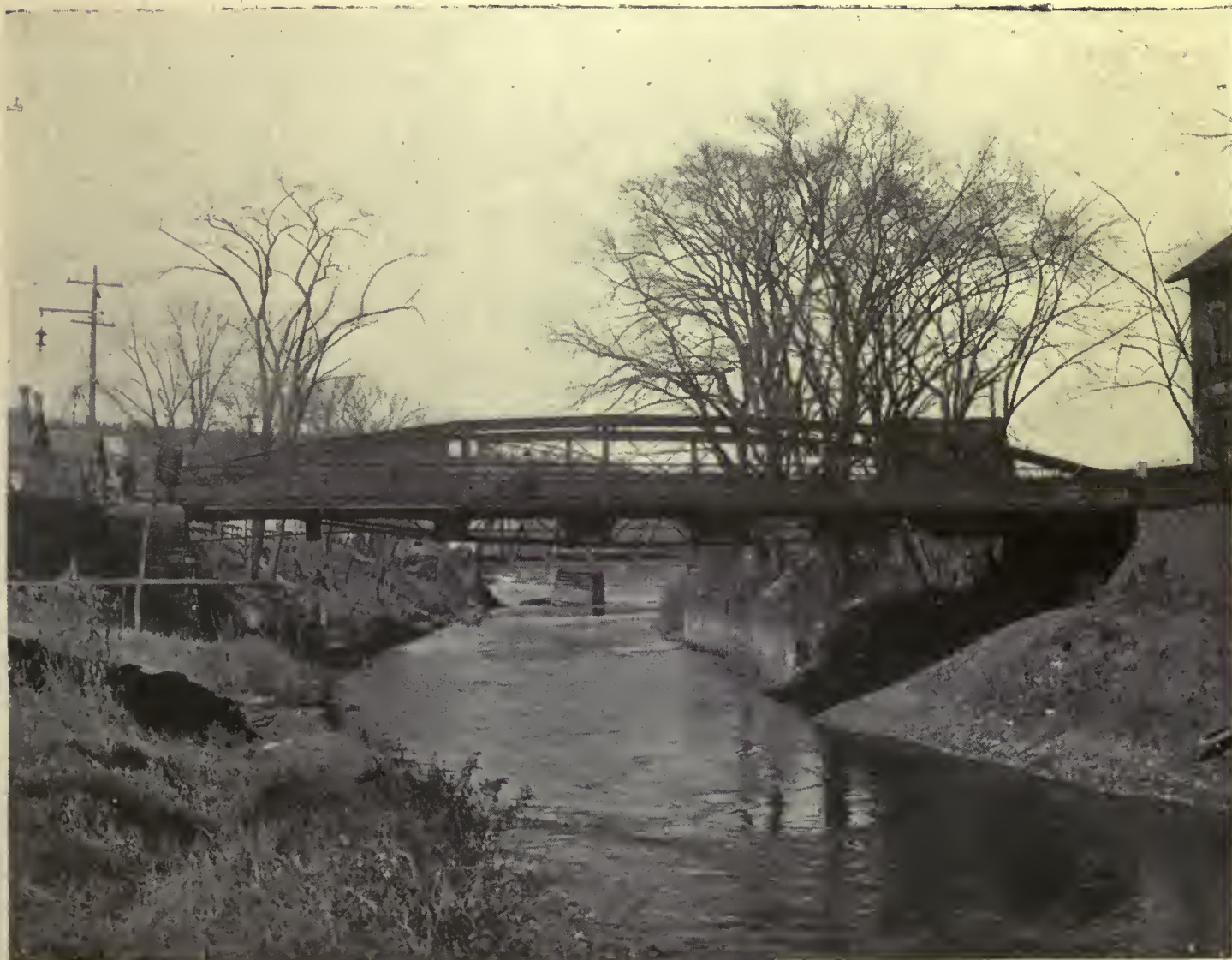
BELLOWS FALLS CANAL—LOOKING NORTH