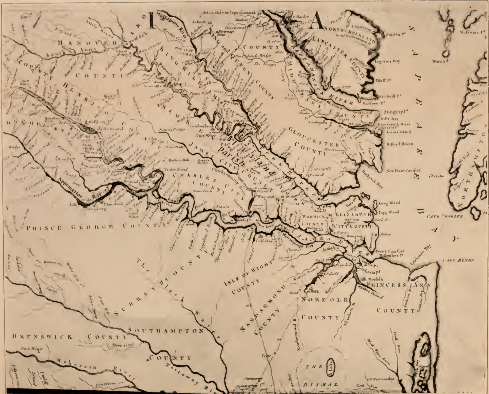
SECTION OF A MAP OF THE MOST INHABITED PART OF VIRGINIA . . . BY JOSHUA FRY AND PETER JEFFERSON, 1775 EDITION, TO WHICH HAVE BEEN ADDED, AT THE PROPER PLACES, THE NAMES "BLISLAND PARISH" AND "APPOMATTOX RIVER."