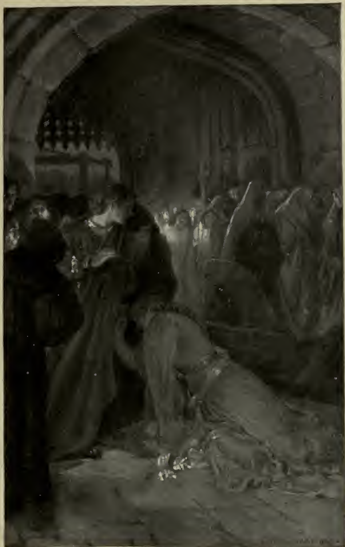
"SHE . . . FELL UPON THE BODY IN A STORM OF TEARS"