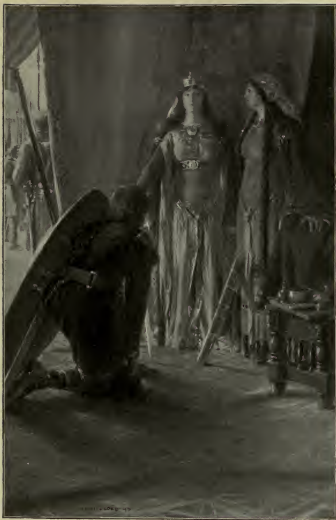
THE KNIGHTING OF GILBERT