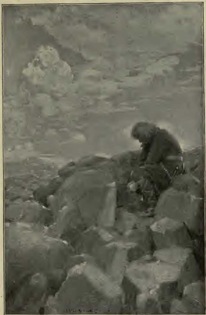
"GILBERT . . . REACHED THE HIGHEST LEDGE"