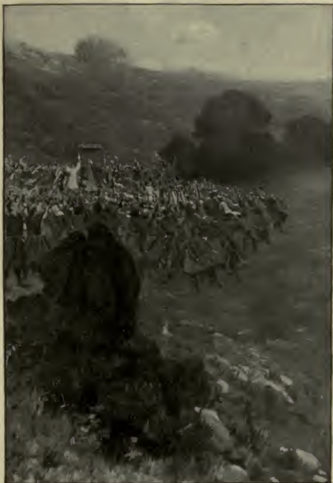
“CROSSES! GIVE US CROSSES!”