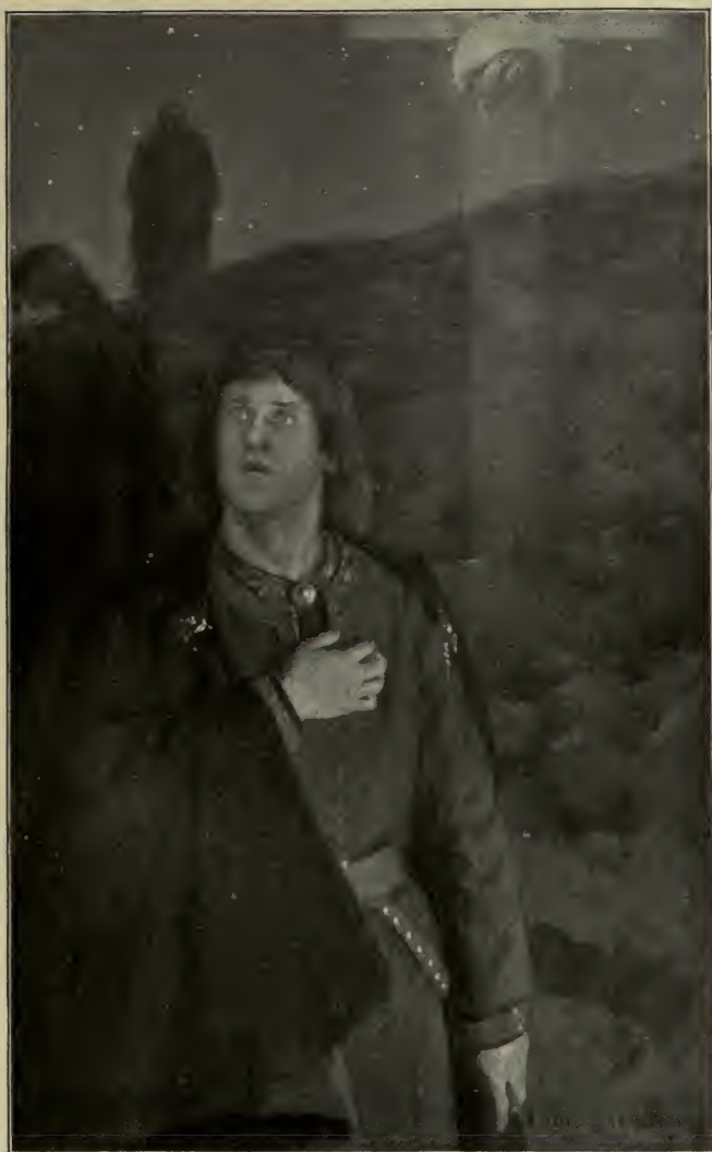
THE WAY OF THE CROSS