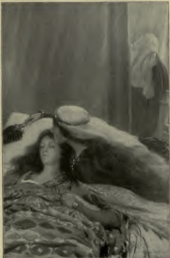
“KISSED THE PALE FOREHEAD”