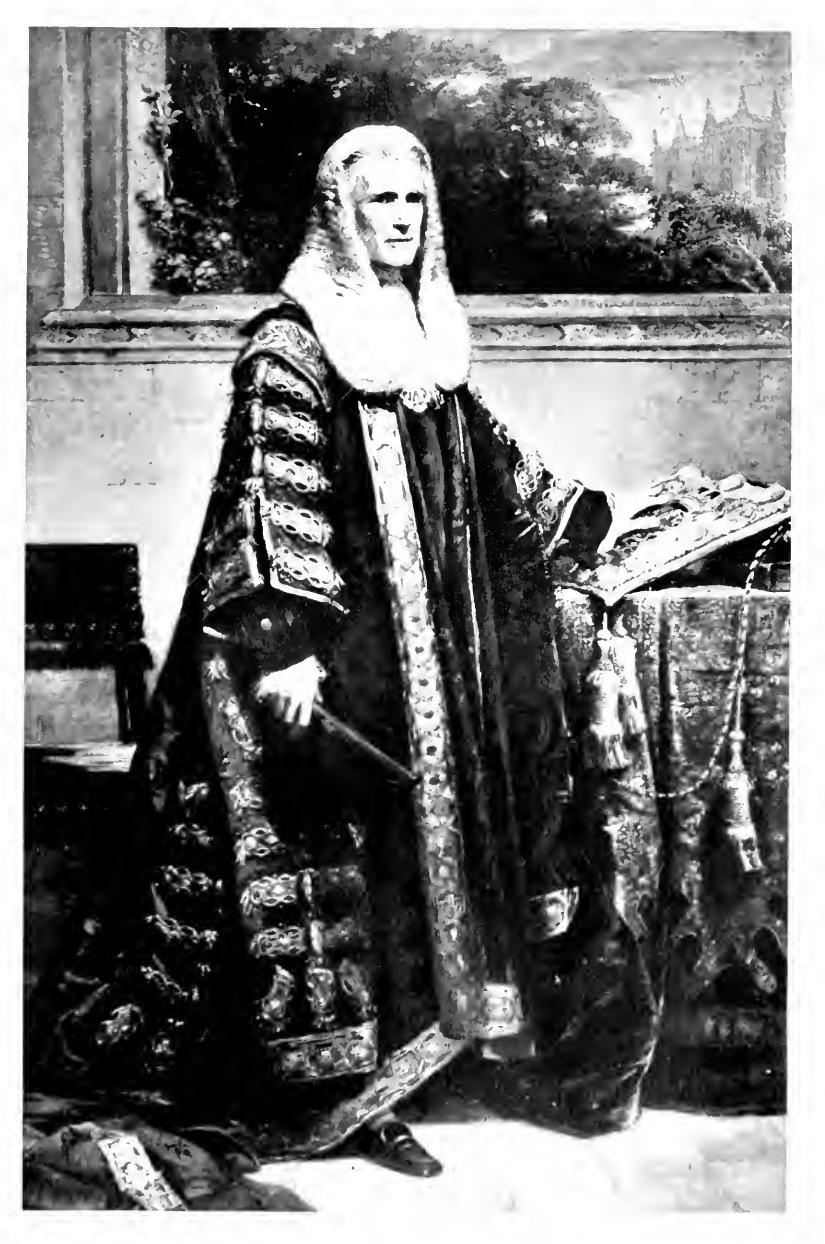
LORD HATHERLEY From the Ficture by George Richmond, R.A. in the National Portrait Gallery