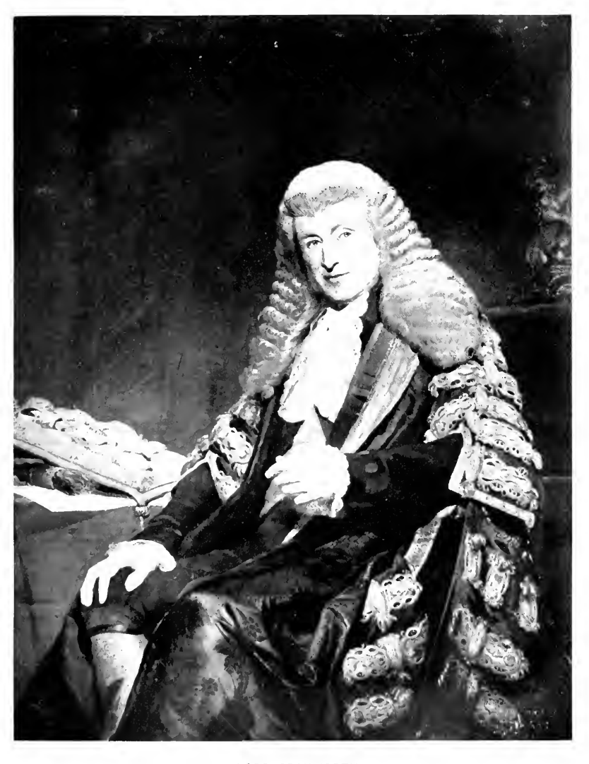
{\it LORD-CRANWORTH} \\ From the {\it picture by George-Richmond, R.A.}\ in the National Portrait Gallery