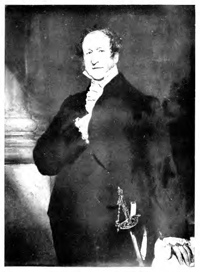
JOHN, LORD CAMPBELL, LORD CHIEF JUSTICE OF THE QUEEN'S BENCH From a Portrait by Thomas A Wolnoth in the National Pintrait Gallery