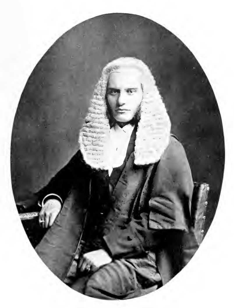
SIR FARRER HERSCHELL, Q.C., SOLICITOR-GENERAL From\ a\ photograph