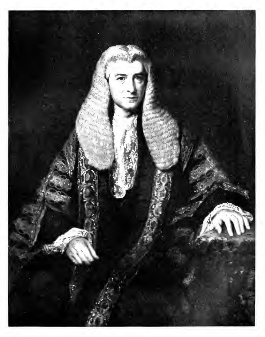
LORD CHELMSFORD From a painting by I. W. Eddis in the possession of the present Peer.