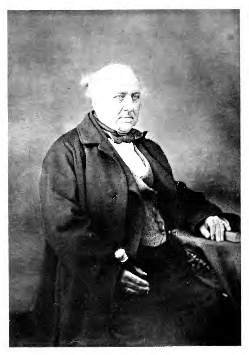
LORD WESTEURY From a photograph