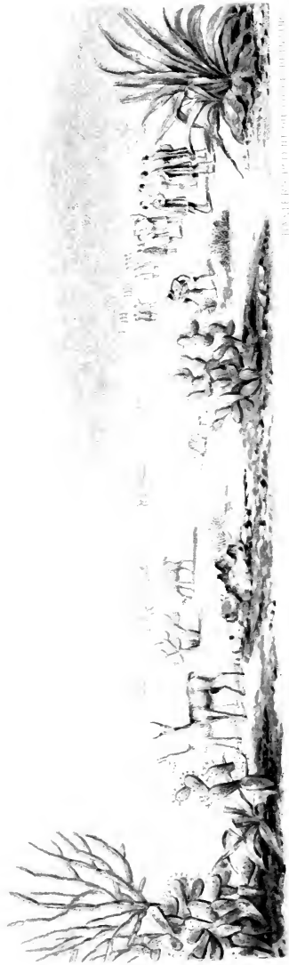
INDIAN PEASANTS AT THE MILL IN CHIMBORAZO