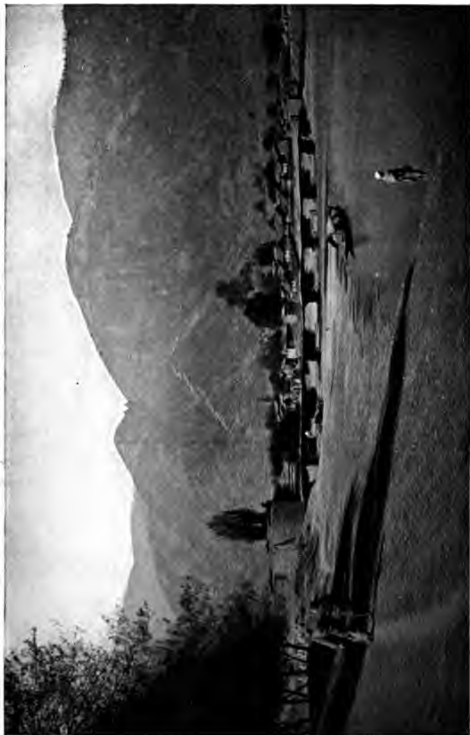
BARAMULA FROM THE SOUTH-SIDE OF THE JHELUM.