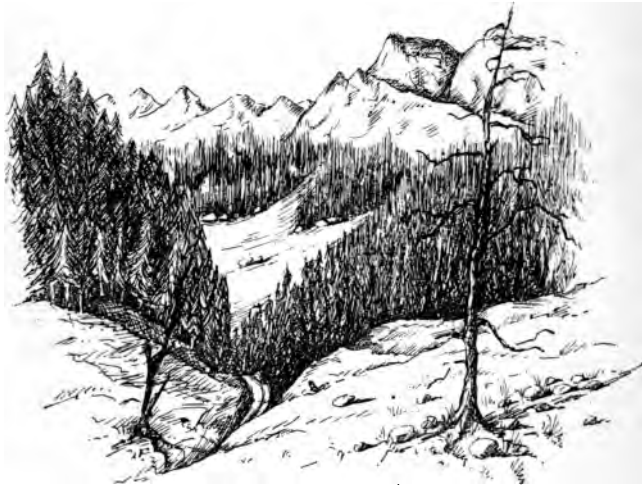
A SKETCH IN KASHMIR.