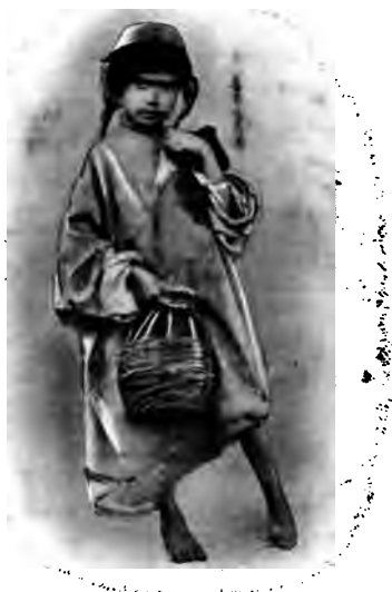
A LAME KASHMIRI CHILD.