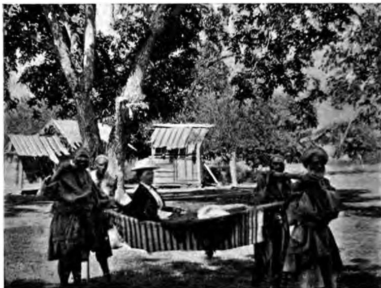
IN A DANDY, KASHMIR.