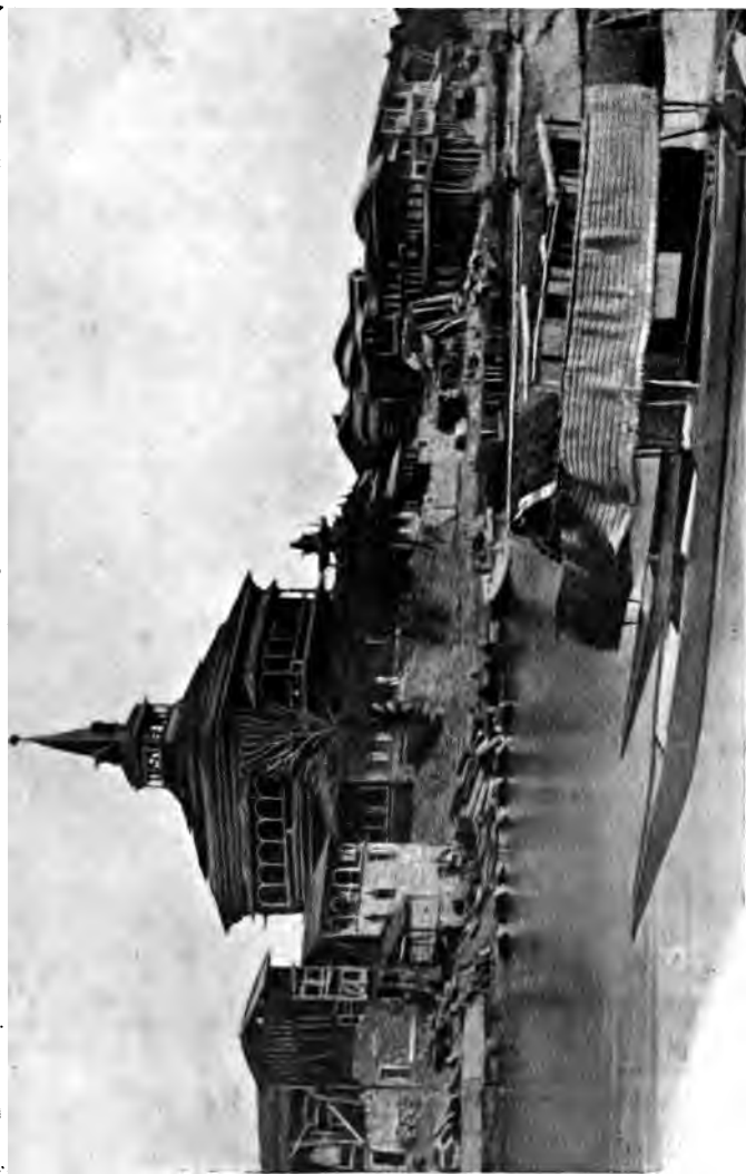
RIVER JHELUM, WITH THE TOMB OF SHAN HAMADAN, SRINAGAR.