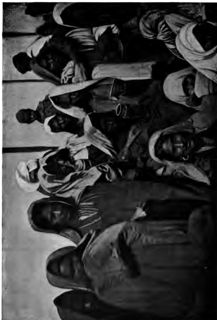
DISPENSARY PATIENTS SRINAGAR.