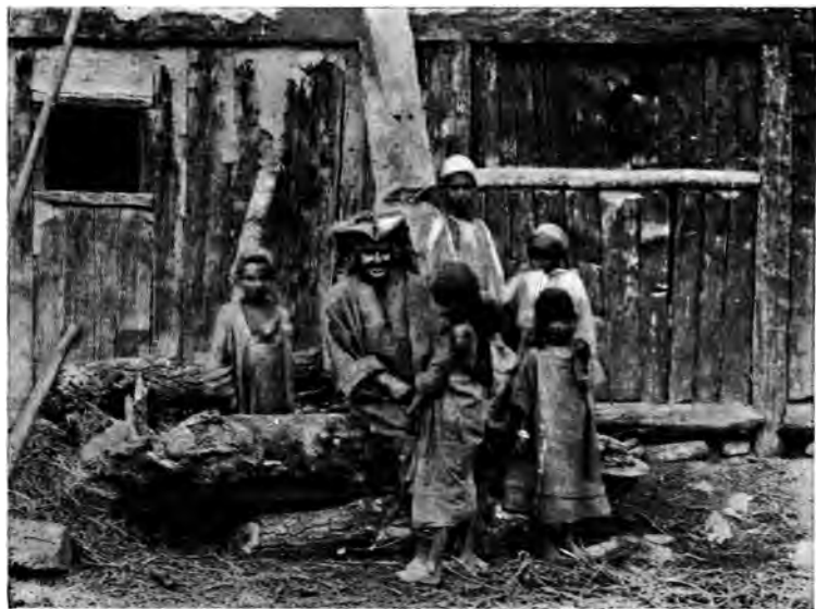
A KASHMIRI FAMILY.