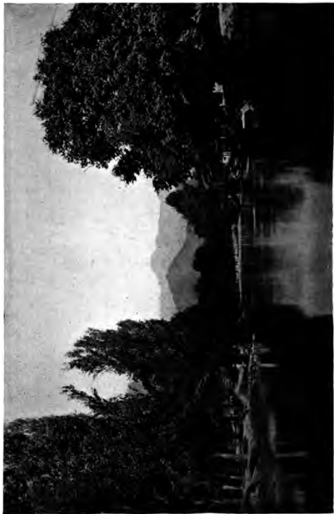
ON THE DHAL CANAL, WITH TAKT-I-SOLIMAN.