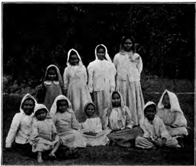
OUR ORPHAN CHILDREN.