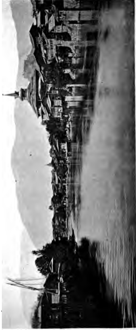
SRINAGAR FROM THE THIRD BRIDGE OVER THE JHELUM.