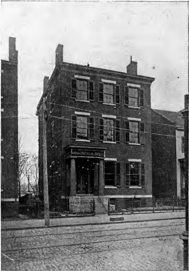
VIRGINIA HISTORICAL SOCIETY'S BUILDING, (War Residence of General R. E. LEE,) NO. 707 EAST FRANKLIN STREET, RICHMOND, VA.