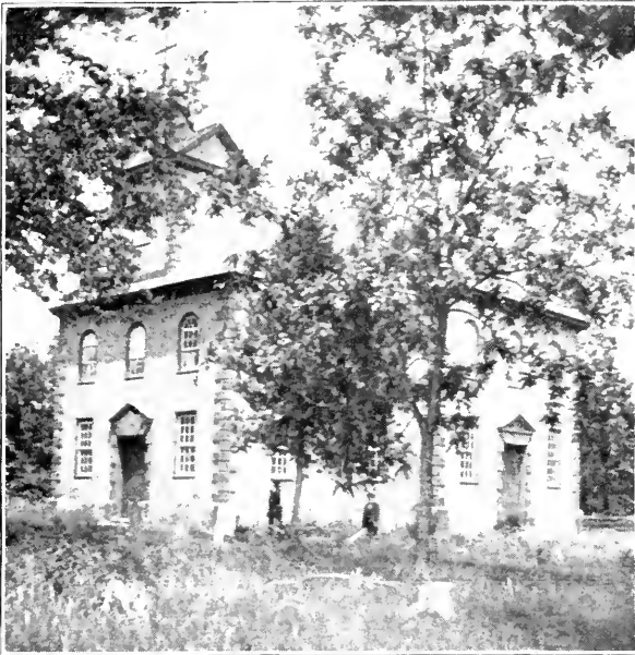
EXTERIOR VIEW AQUIA CHURCH, 1899.