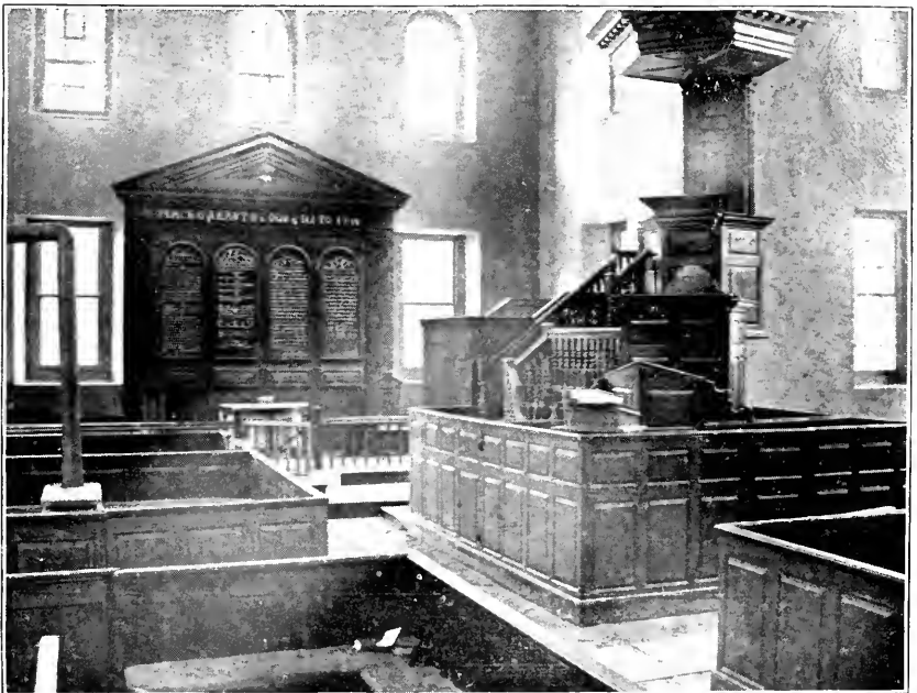
INTERIOR VIEW AQUIA CHURCH, 1899.