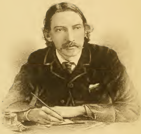
Robert Louis Stevenson