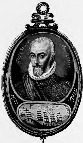
SIR WALTER RALEIGH