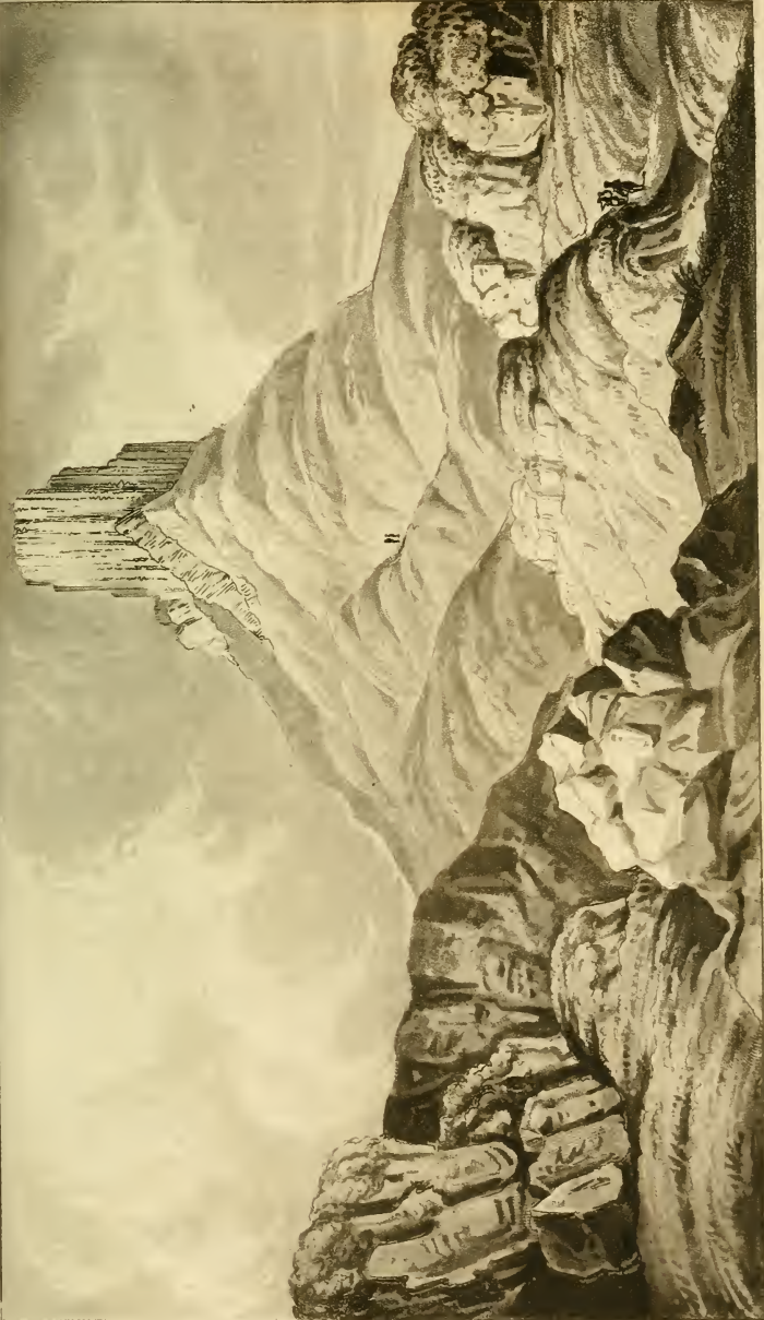
The Snow of Fuji from the East