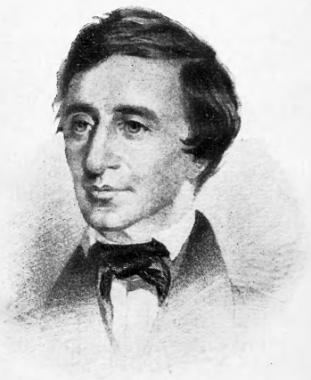
HENRY DAVID THOREAU