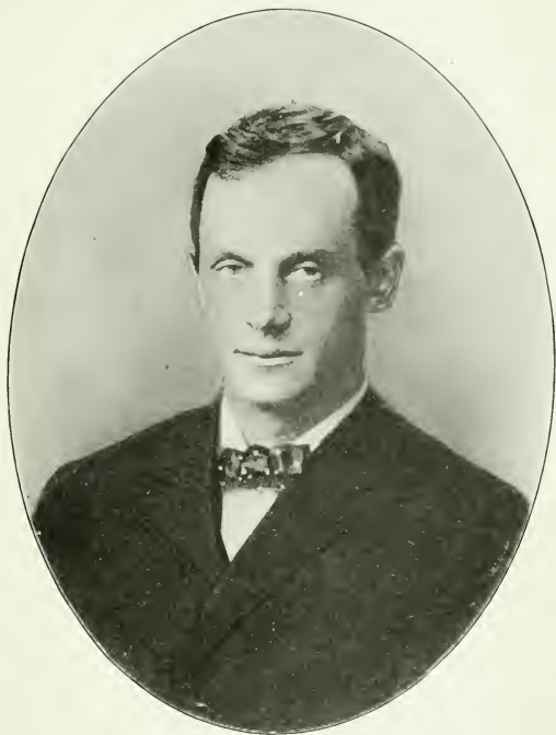
DODD AS A YOUNG MAN