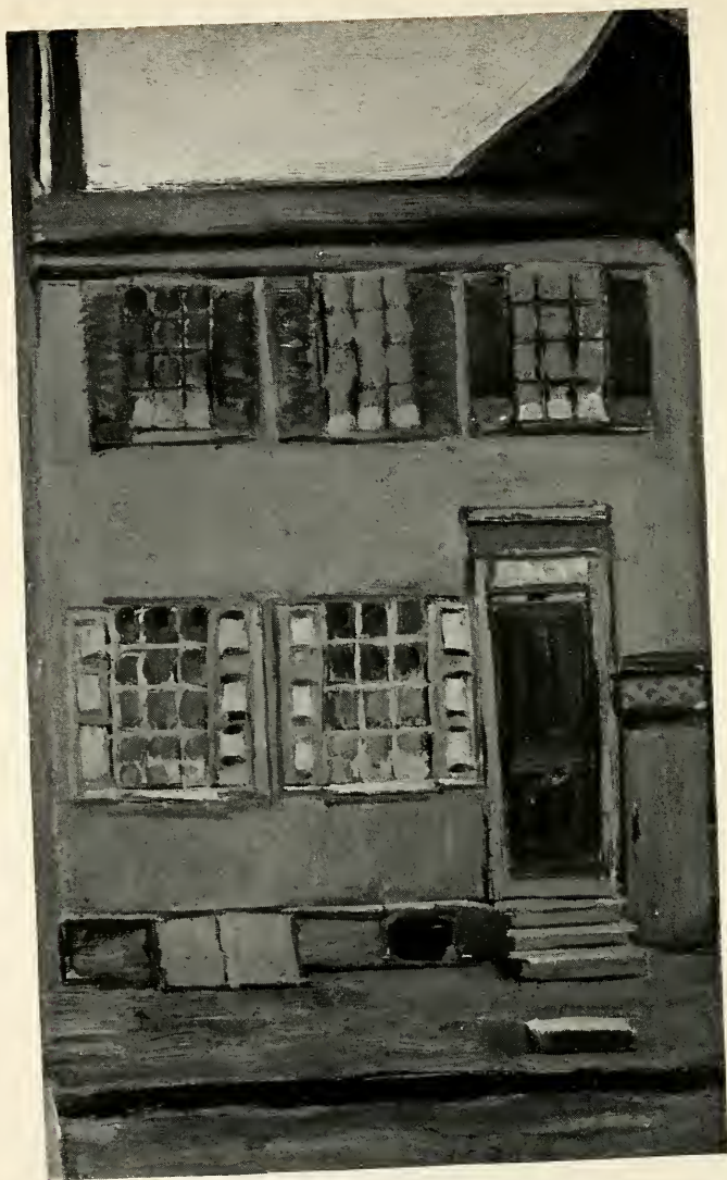
328 MICKLE STREET FROM A PAINTING [1908] BY MARSDEN HARTLEY