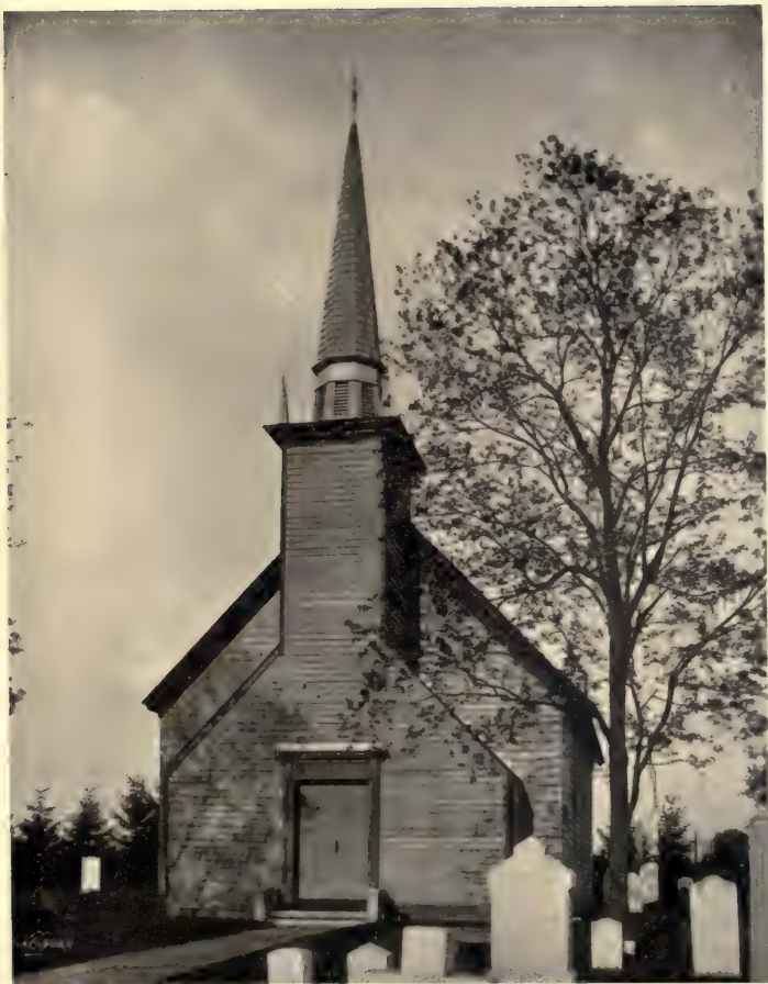
THE OLD MOHAWK CHURCH, GRAND RIVER