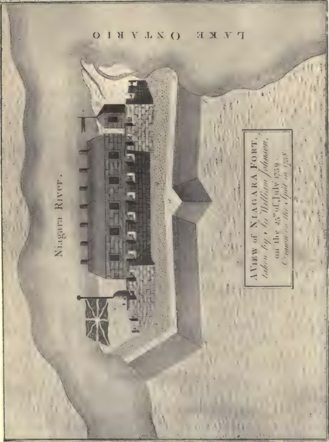
VIEW OF FORT NIAGARA

A VIEW OF NIAGARA FORT, taken by Sir William Johnson, on the 25 th of July 1759. Drawn on the spot in 1758.