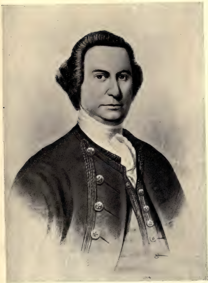
SIR WILLIAM JOHNSON From a contemporary engraving