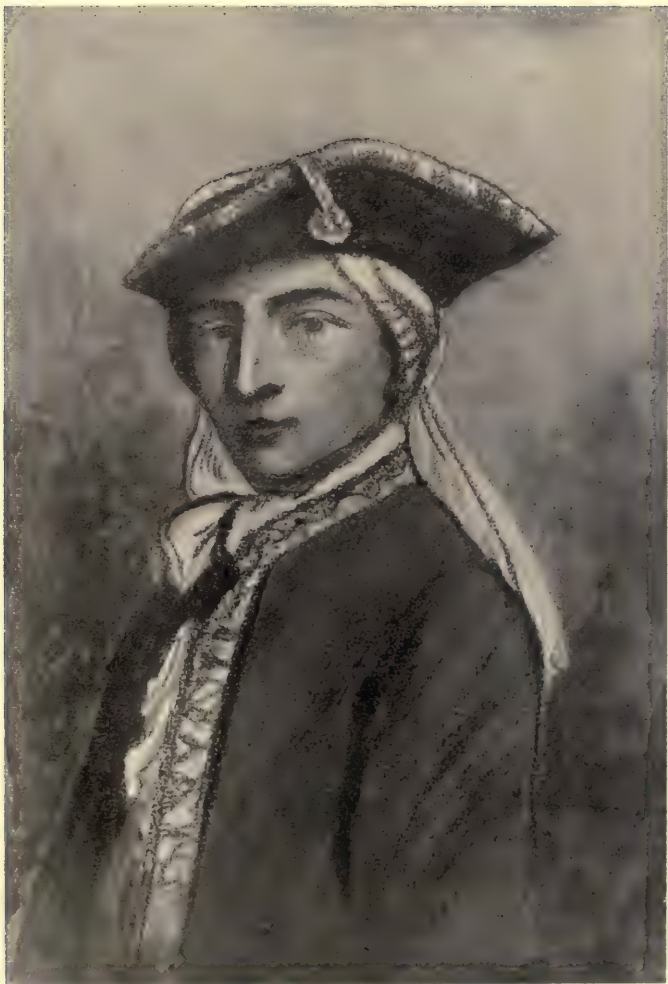
COLONEL GUY JOHNSON