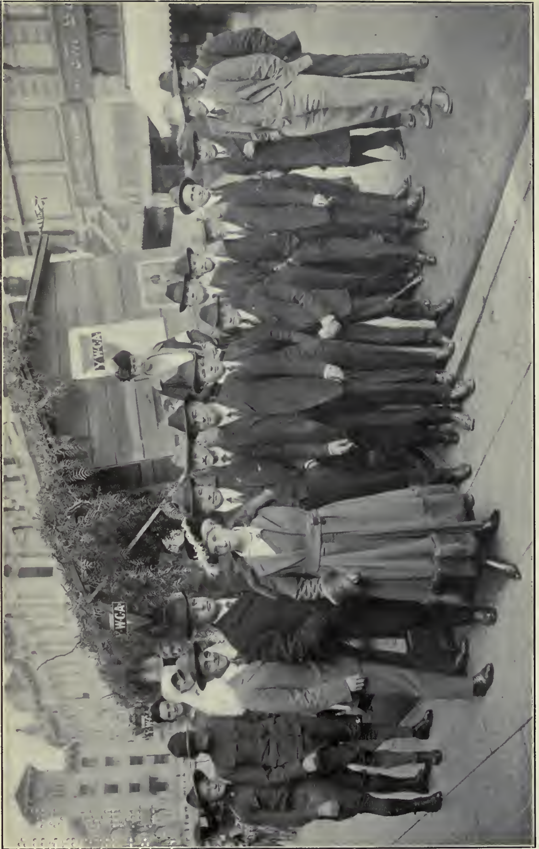
Representative members of the Santa Clara County War Work Council and Women's Mobilized Army: