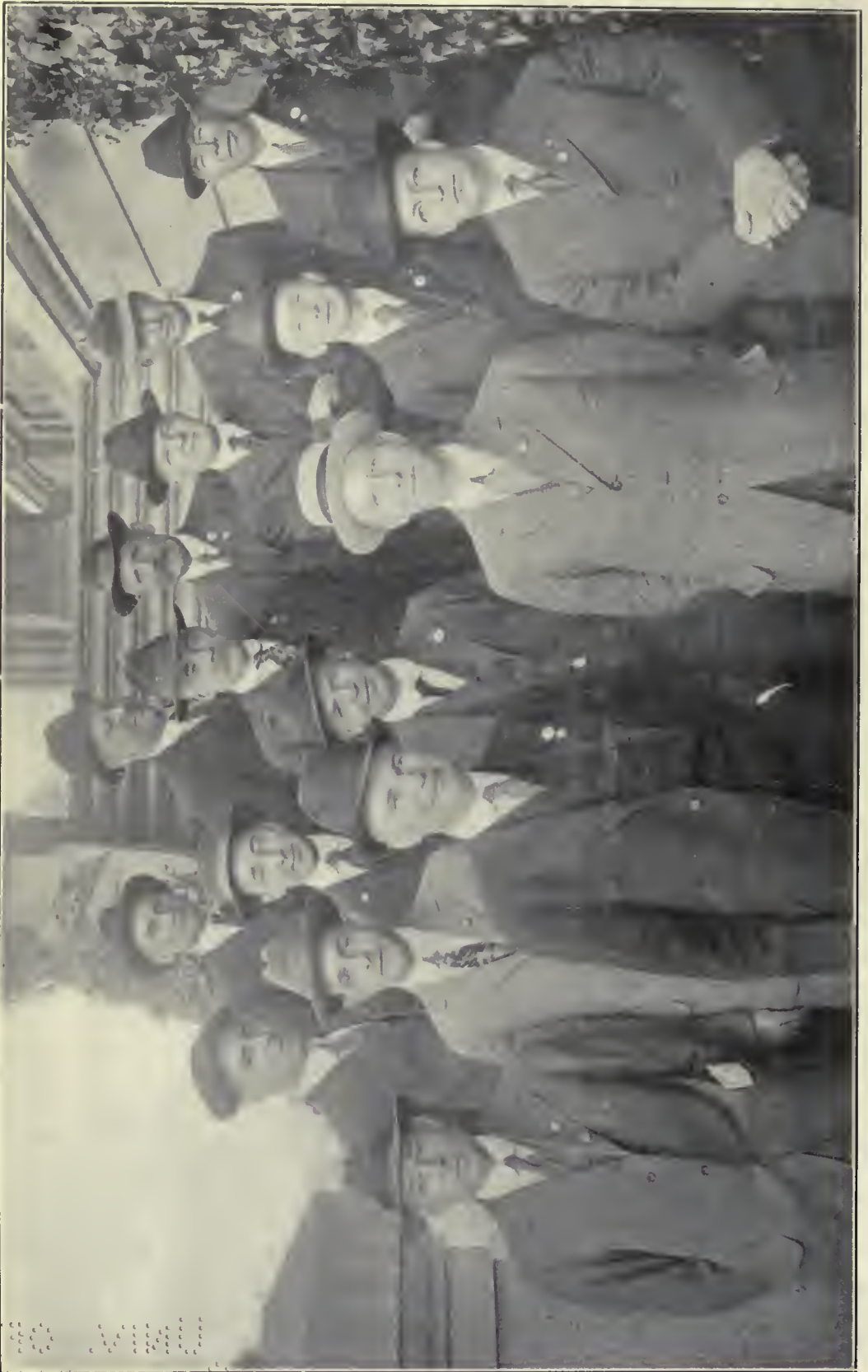
Officers and members of Santa Clara County War Work Organizations: