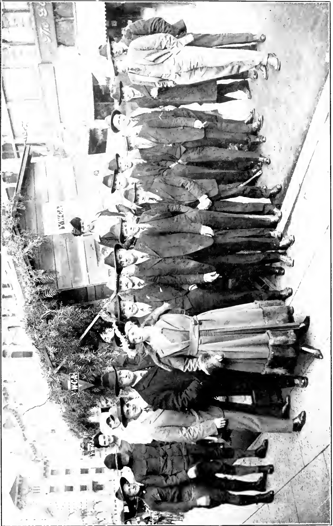
Representative members of the Santa Clara County War Work Council and Women's Mobilized Army: