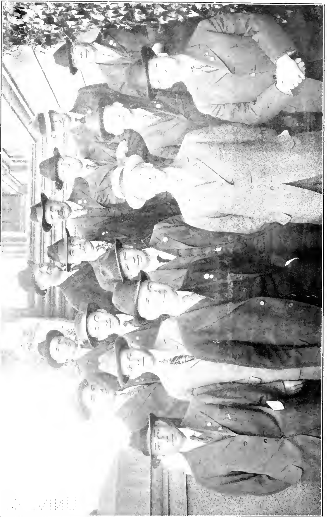
Officers and members of Santa Clara County War Work Organizations: