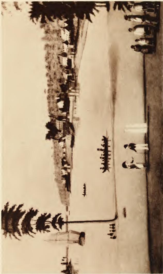
FORT MALDEN AND AMHERSTBURG IN 1812