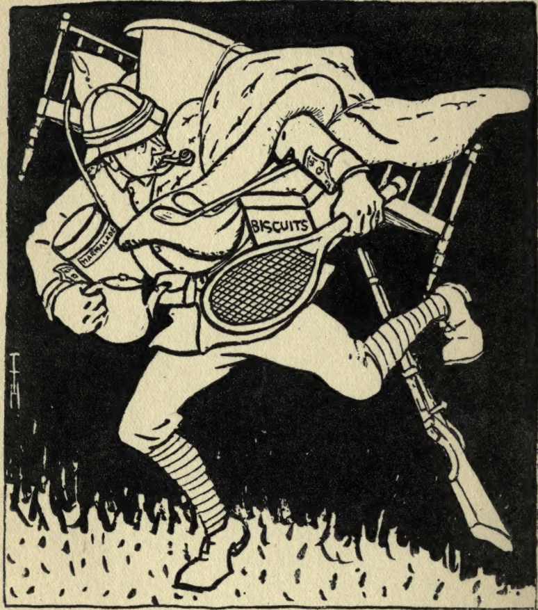
ENGLISCHE KRIEGSFÜHRUNG (How the Englishman makes war.)