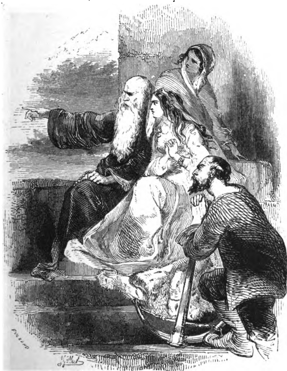
LADY EVELINE AND THE PRIEST ON THE BATTLEMENTS.