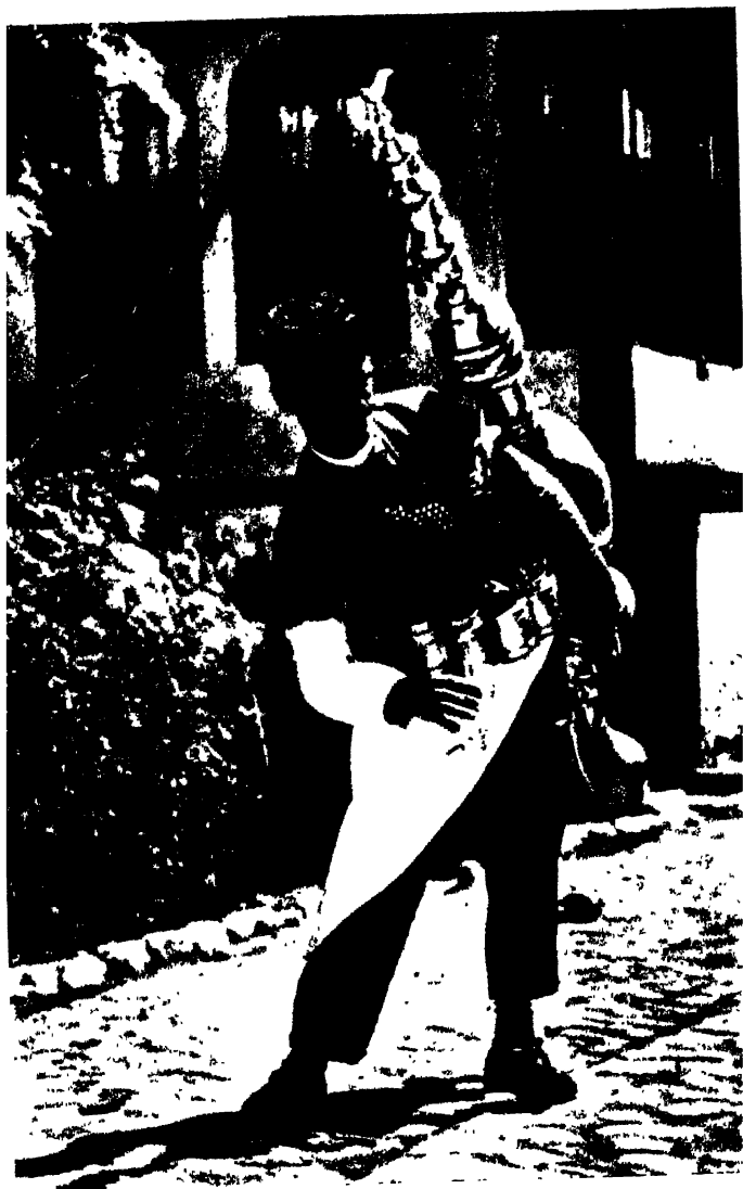
A SELLER OF 'BOZA,' A TEMPERANCE DRINK