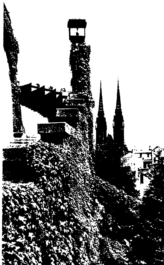
ZAGREB : FROM THE ŠTROSSMAJER ALLEY