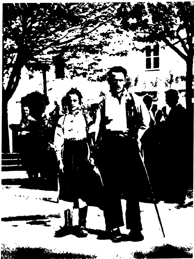
LIKA PEASANTS AT OBROVAC