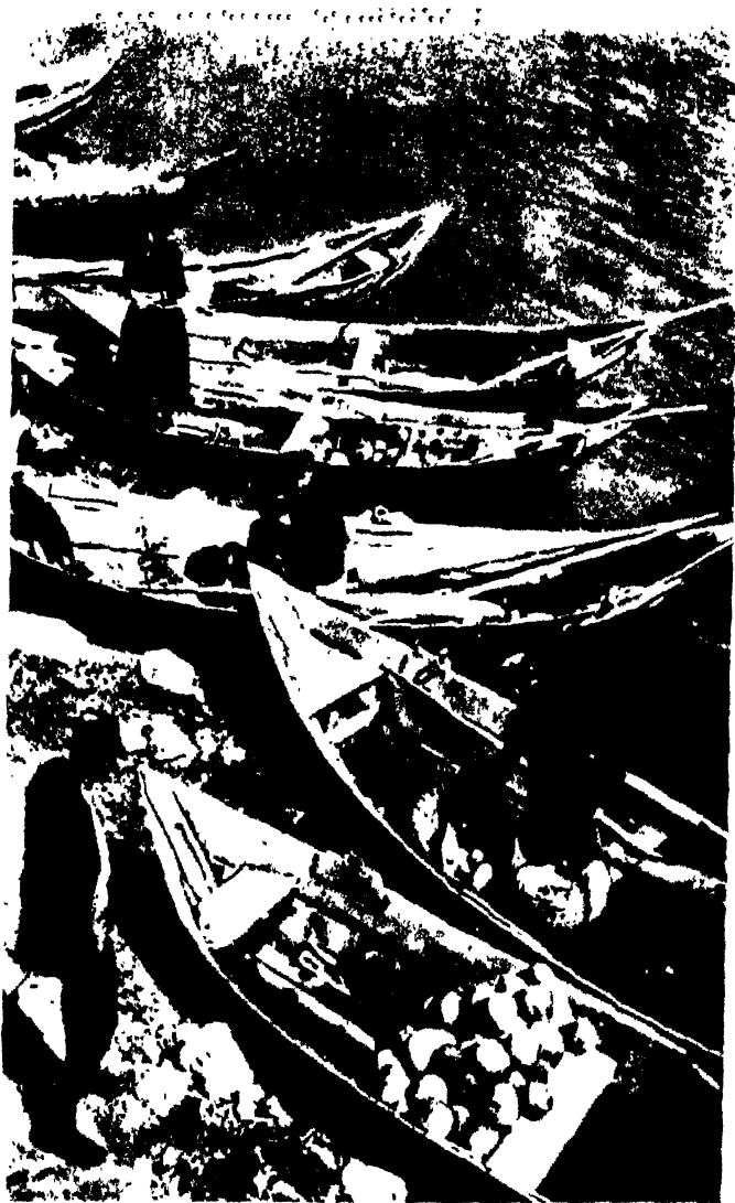
FROM THE LAKE OF SKADAR