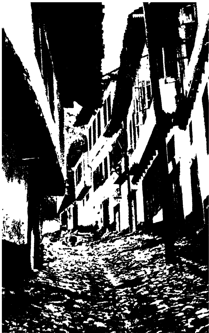
STREET IN OHRID