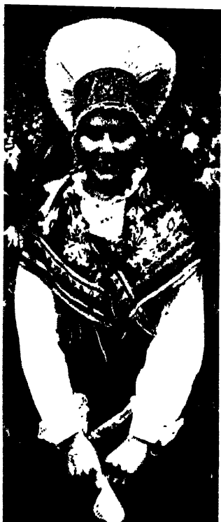
SOUTH SERBIAN COSTUME