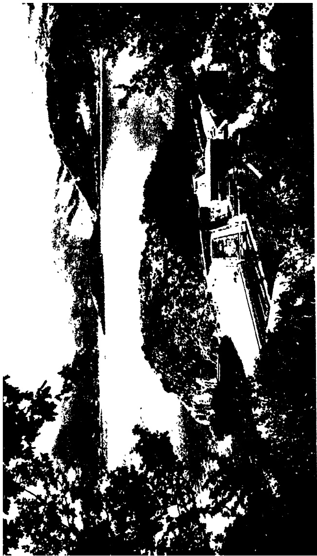
YUGOSLAV ROYAL SUMMER PALACE, AT MILOČER, NEAR BUDVA