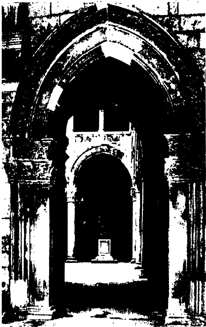
GATEWAY OF THE PALACE OF THE RECTORS, DUBROVNIK