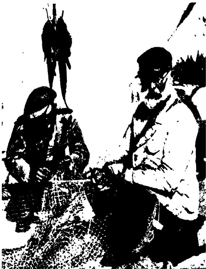
MENDING NETS, ISLAND OF SILBA