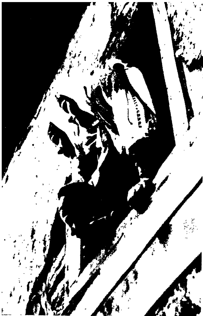
FROM TETOVO IN SOUTH SERBIA. WATCHING A WEDDING PROCESSION