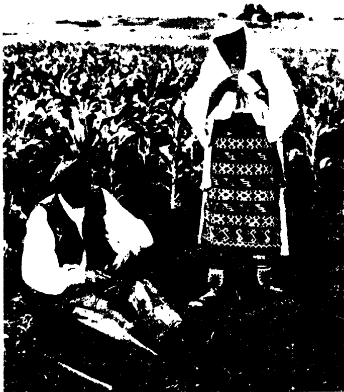
PEASANTS FROM THE LIKA