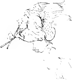
No. 1 by Alexander Dobkin

Florentine red on cream approx. 4" by 4"