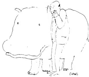
No. 2 by Gans

Florentine red on cream approx. 4" by 4"