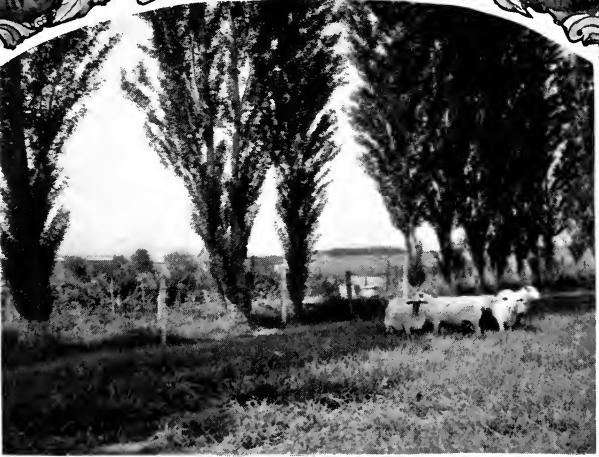
Weiser is one of the Primary Sheep-feeding Districts of the United States

year. While no region anywhere is perfectly immune from frost danger, we have such immunity that crops are practically certain without "smudging" and absolutely certain with it.