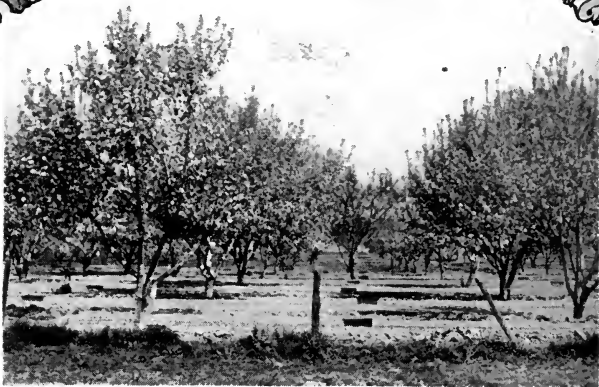
Orchards are Scientifically Cultivated and Yield Maximum Returns