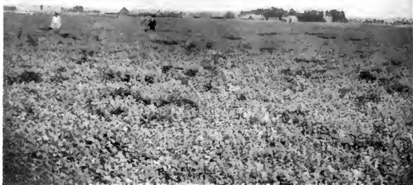
Alfalfa Yields Six and Eight Tons per Acre a Year