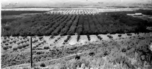
Fruit-raising near Weiser is a Fully Demonstrated Success

peaches, plums, cherries, etc., a little less. Profits increase with the age of the trees.