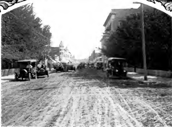
Street Scene in Weiser, Idaho