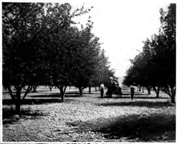
Spraying Apple Orchard near Weiser

In order to answer such inquiries as the intelligent reader would be most likely to propound concerning Weiser, the information is conveyed in the form of questions and answers.