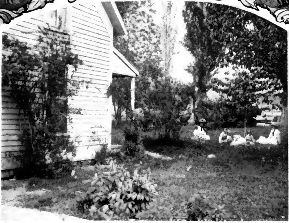
Country Home near Weiser