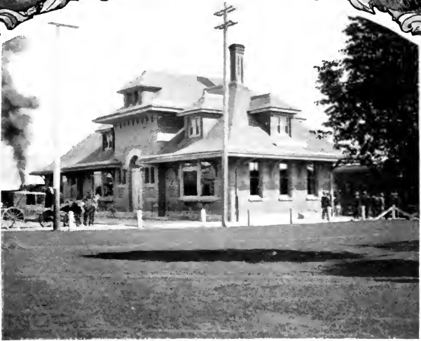
Railroad Station on the Main Line of the Oregon Short Line. at Weiser