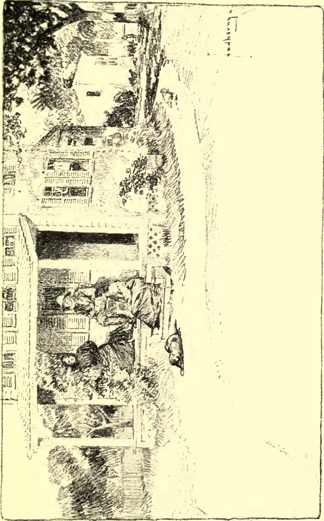
WESTERN FARMERS STILL OWN THEIR FARMS