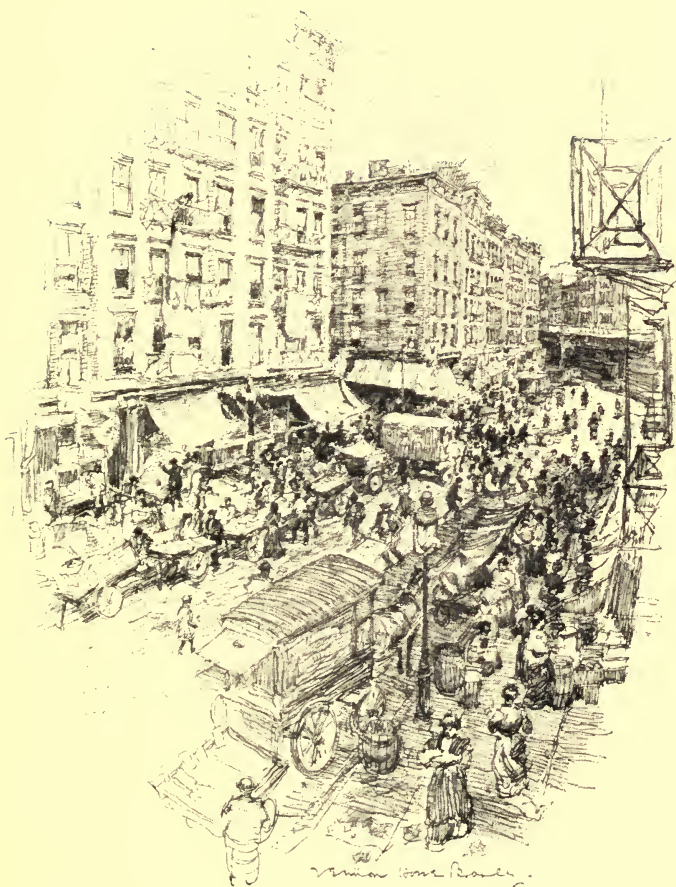
NEW YORK'S CROWDED, LITTERED EAST SIDE