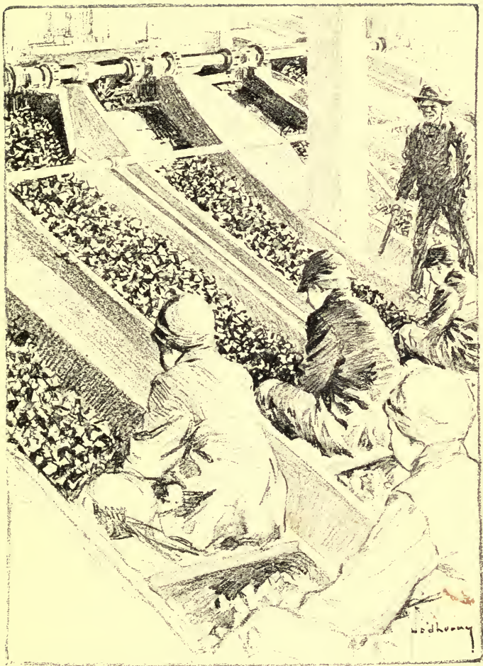
BREAKER BOYS AT A PENNSYLVANIA COLLIERY