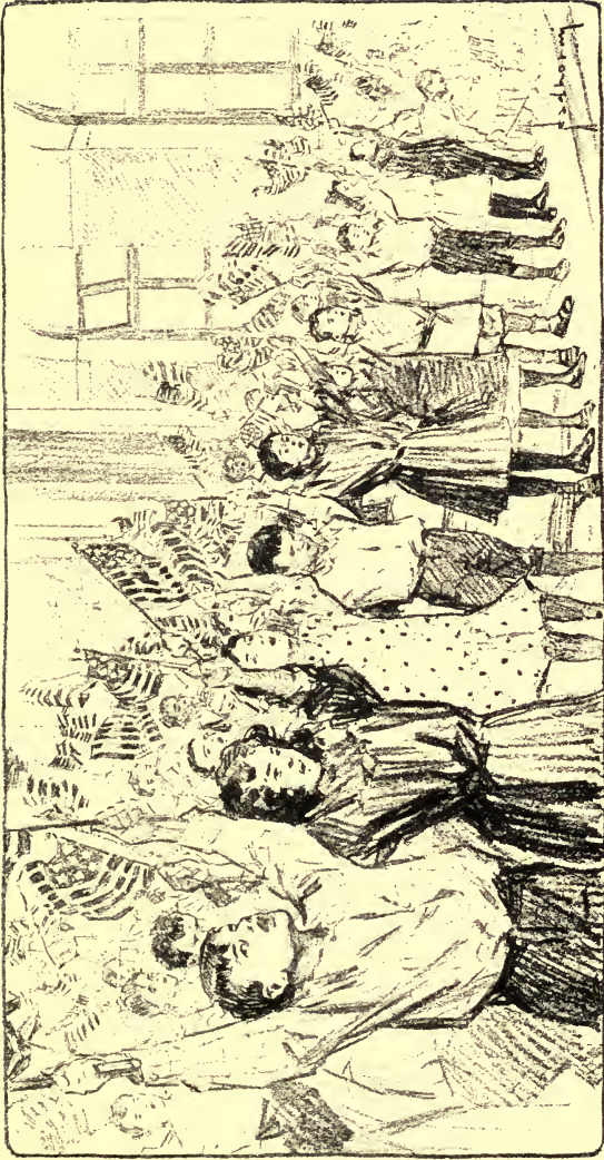
WHERE IMMIGRANT CHILDREN ARE AMERICANIZED